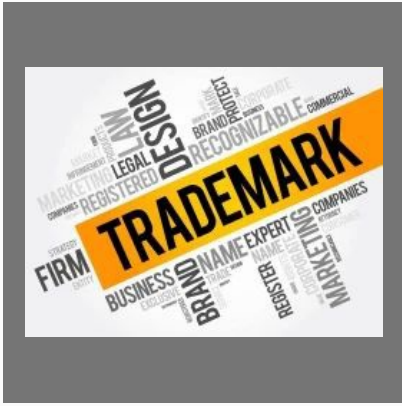
Trademark Registration Service