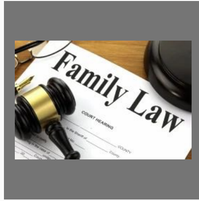
Family Matter Lawyers Service