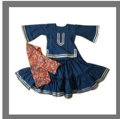
Casual Wear Kids Ghagra Choli