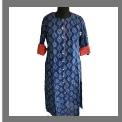
Ladies Designer Printed Kurtis