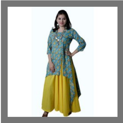
Ladies Designer Cotton Kurti