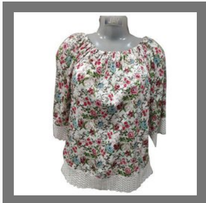
Ladies Cotton Printed Top