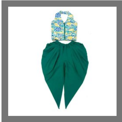
Kids Dhoti With Top