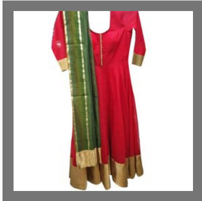
Ladies Floor Length Anarkali Suits