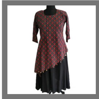
Ladies Stylish Cotton Printed Kurti