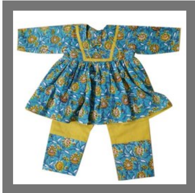
Kids Anarkali Kurti With Pant