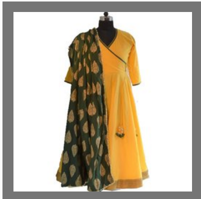
Ladies Fancy Silk Dupatta