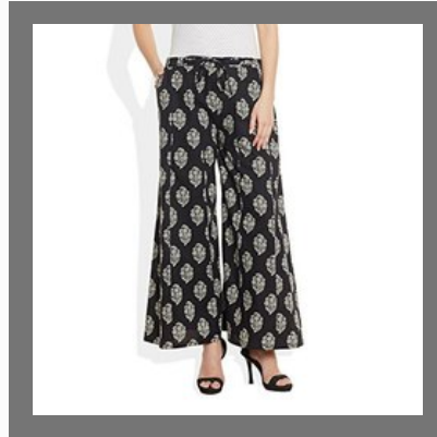
Ladies Palazzo Pants