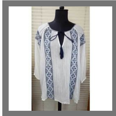
Ladies Cotton Tops