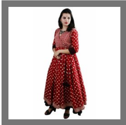
Ladies Fancy Jaipuri Kurtis