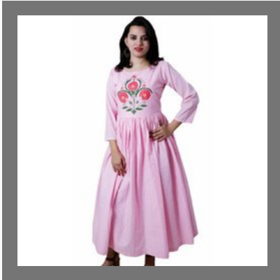
Long Anarkali Kurti