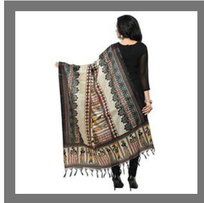
Designer Cotton Dupatta