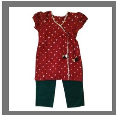
Kids Anrakha Kurti With Pant