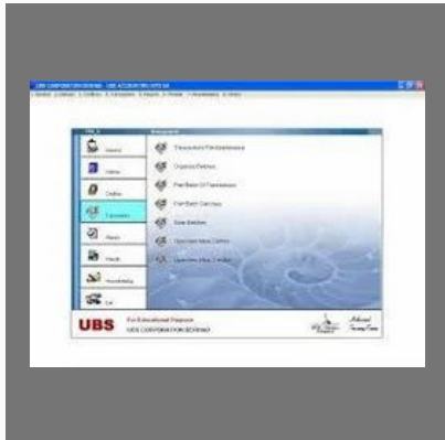
Maintenance of Accounting Register