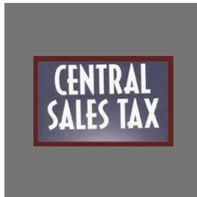
Central Sales Tax