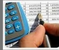
Loan Project Preparation