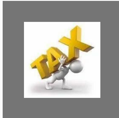
Various Direct And Indirect Taxes