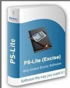
Maintenance of Excise Registers