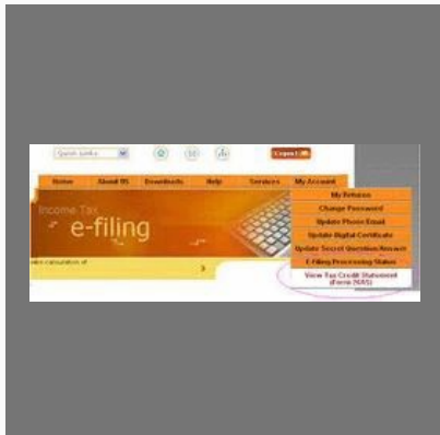
E- Registration of Various Taxes & E-filing