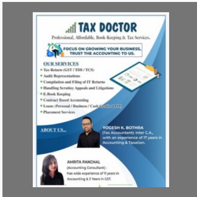
Tax And Account Service , Contract Based Accounting