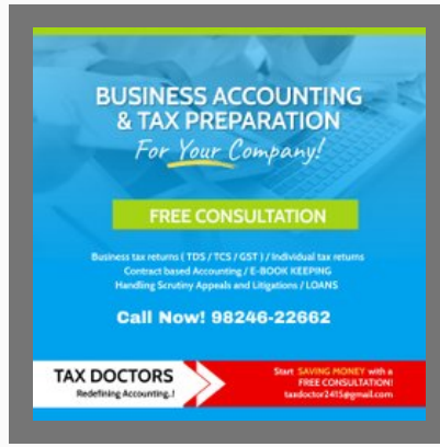
LOANS AND E-BOOK KEEPING