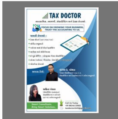
GST REGISTRATION AND RETURN FILING