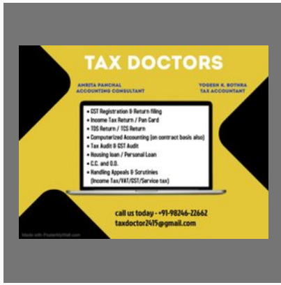
TDS & TCS Return Filing Filing Services