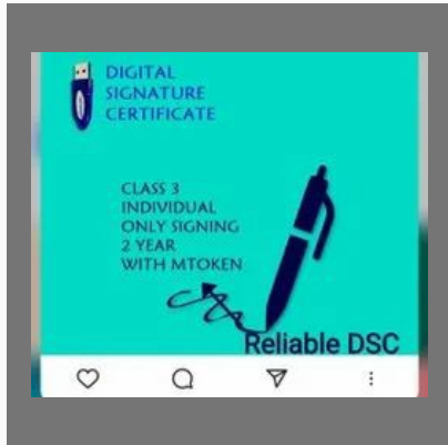
Digital Signature Certificate