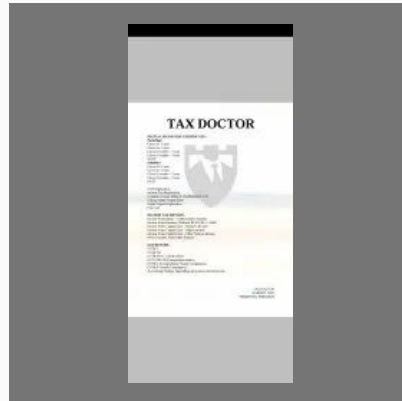
Digital Signature Certificate Class 3