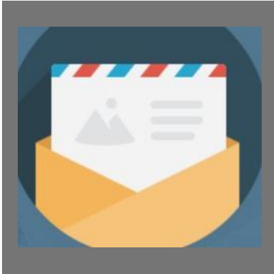
Service Tax Registration Services