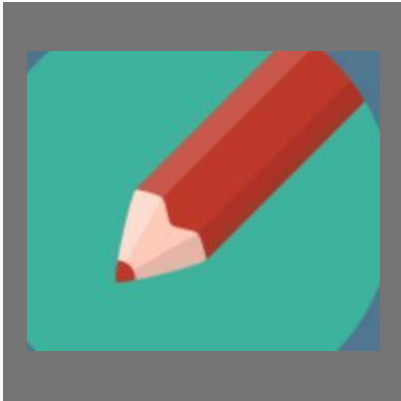
ISO Certification Services