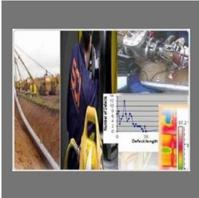
Non Destructive Testing Service