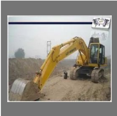
Equipment Rental Service