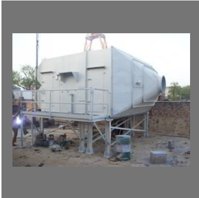
Air In Take Filter Housing