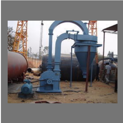
Air & Water Cooled Pulveriser