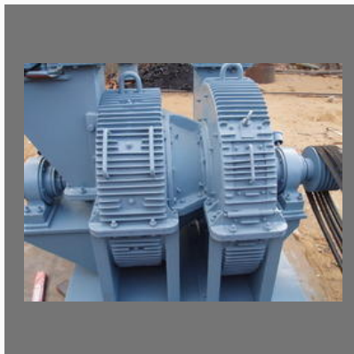
Air Cooled Pulveriser