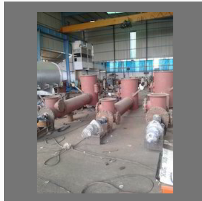
Dust Return Screw Conveyor