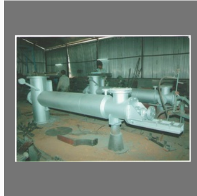
Dust Return Screw Conveyor