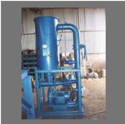
Oil Mist Eleminator Unit