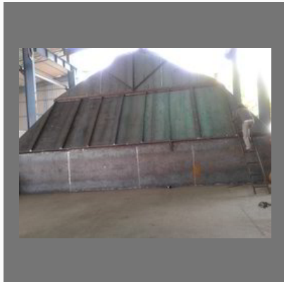
Air Filtration Unit Under Fabrication