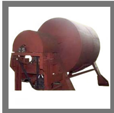
Ball Mill Machine