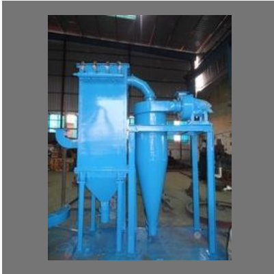
Dust Pollution Control Unit