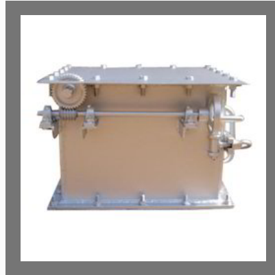
Bottom Seal of 6 Tpd SBP Drum