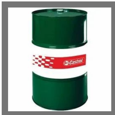
Castrol Hysol MB 50 Water Soluble Cutting Oil