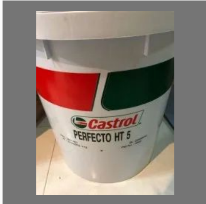
Heat Transfer Fluid