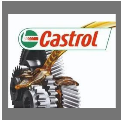
Castrol Optigear BM