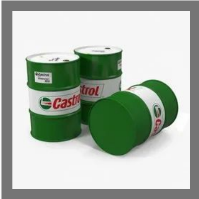
Castrol Neat Cutting Oil