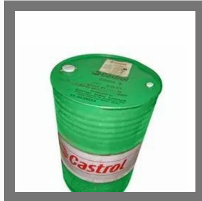
Castrol Tribol Grease