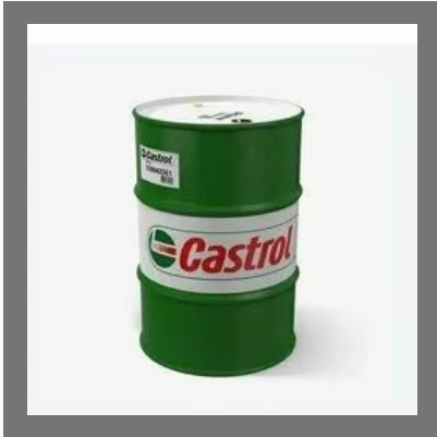
Castrol Neat Cutting Oil