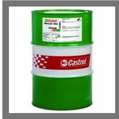
Castrol Neat Cutting Oil