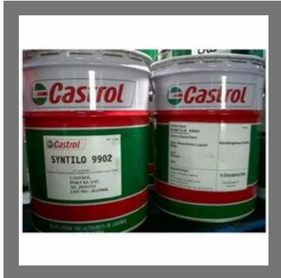
Castrol Syntilo Cutting/ Grinding Oil