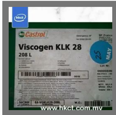
High Temperature Chain Lube Viscogen KLK Range