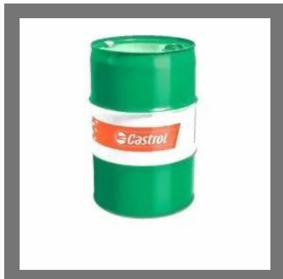
Castrol Alusol Ral BF Water Soluble Cutting Oil