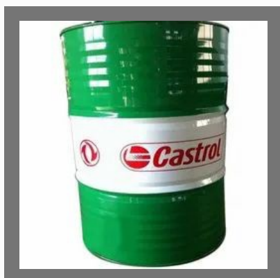
Castrol Carecut Water Soluble Cutting Oil