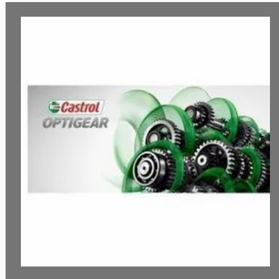
Castrol Optigear Synthetic