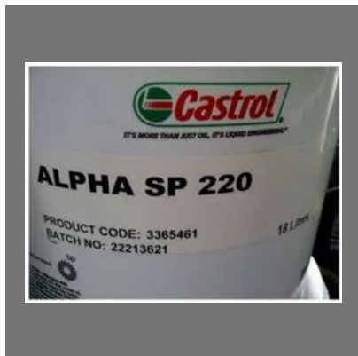
Castrol Alpha Gear Oil