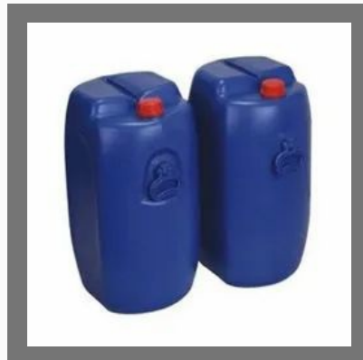
Castrol Optimal Lubricating Greases