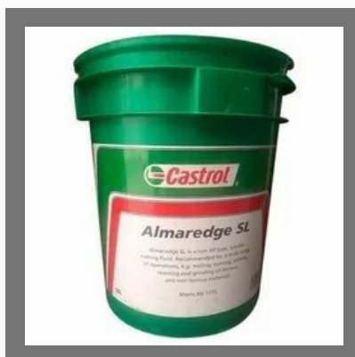
Castrol Almaredge Water Soluble Cutting Oil