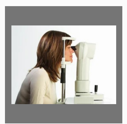
Topograher Model E300