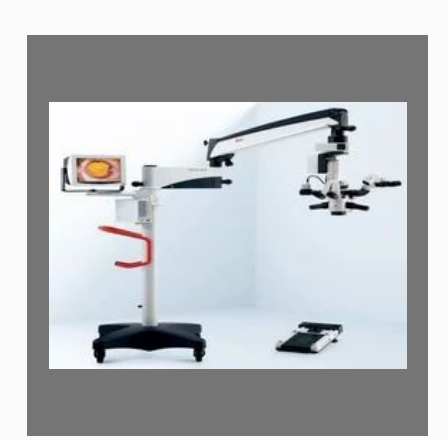
M822 On F20 Stand Leica Microsystem