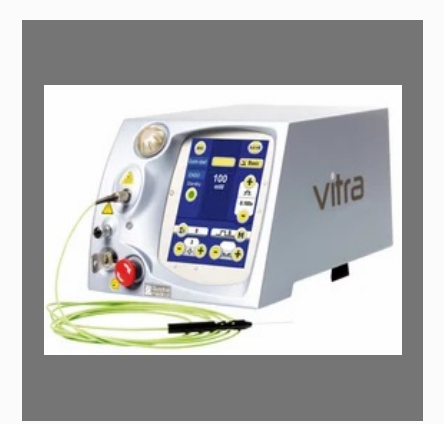
Vitra 532 Monospot Laser