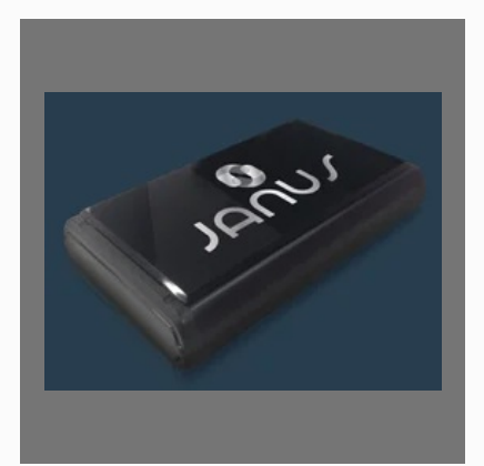
Janus Ascan Pachymeter