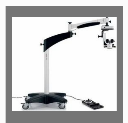
M220 On F12 Stand Leica Microsystem