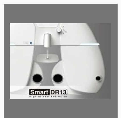
Dr13 Auto Phoropter