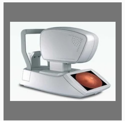
Non Mydriatic Fundus Camera