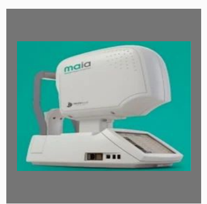
Macular Integrity Assessment Microperimetry