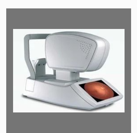
Drs Non Mydriatic Fundus Camera