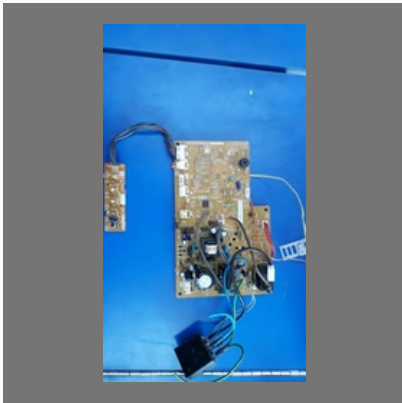
Window AC PCB