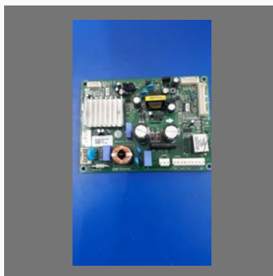
Air Conditioner PCB