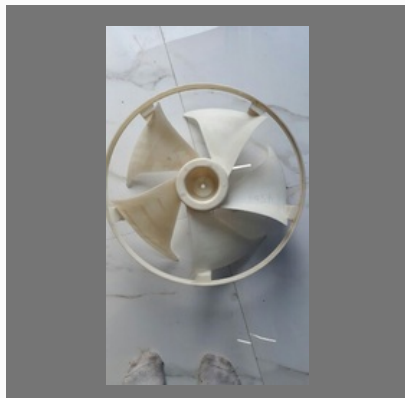
Ac Fan Blade