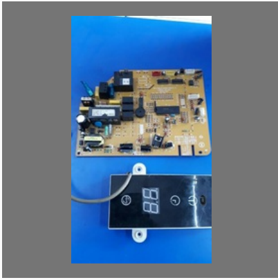
Split AC PCB