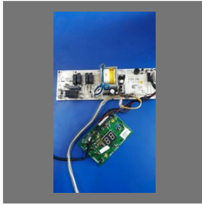
15 Ton AC PCB