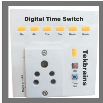
Digital Time Switch Ver1