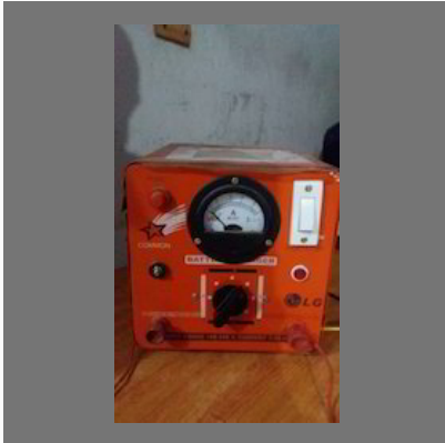
Universal Battery Charger