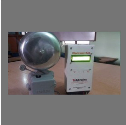
Automatic Electronic School Bell Ver1