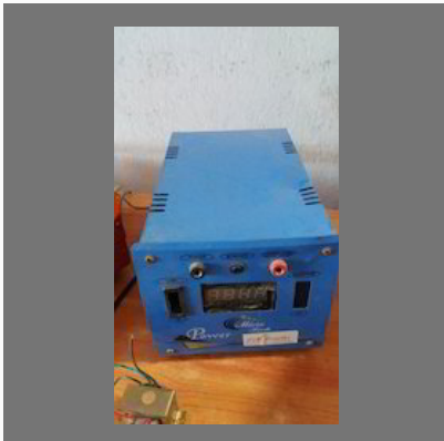
Variable DC Power Supply