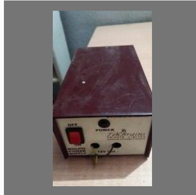
DC Power Supply 12V 2A