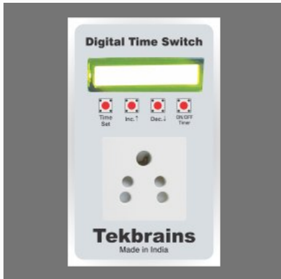
Digital Time Switch Ver2