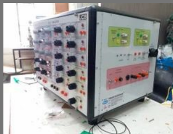
Simulator Testing Jig