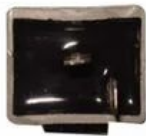
DC Voltage Flasher