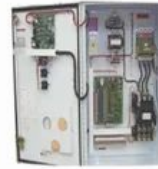
Control Panel Wiring