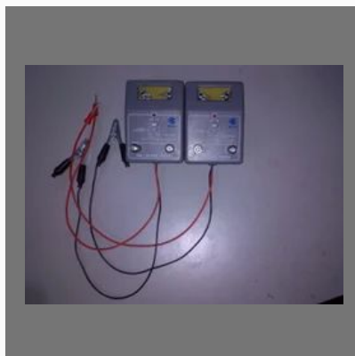
CDI / H.T. Coil Tester