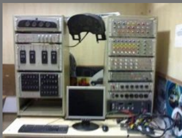
BCU And Cluster Tester Jig