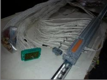
Automobile Electrical Wiring Harness