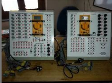
Electronic Control Unit Tester