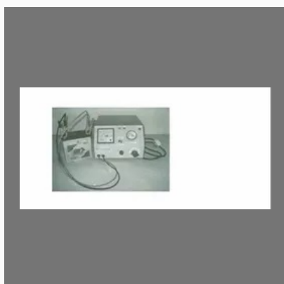
Battery Charger Tester