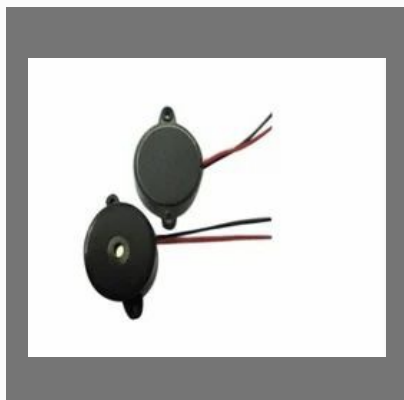
Buzzer For Two Wheelers