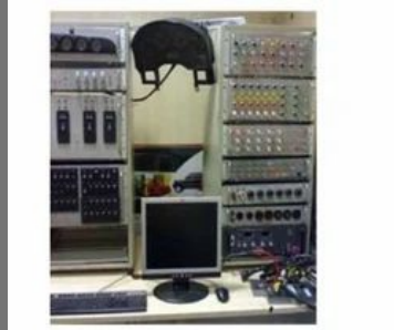
Customized Electronic Automated Test Equipment