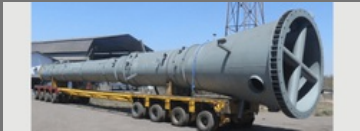
Trichlorosilane Light Impurity Column