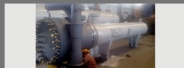
Main Gas Compression