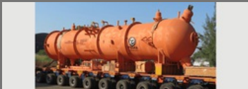
High-Pressure Feedwater Heater