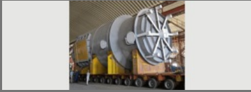
Cold Interpass Gas Heat Exchanger