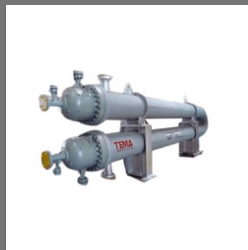
Hairpin Heat Exchanger