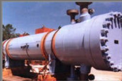
Feed Water Heater