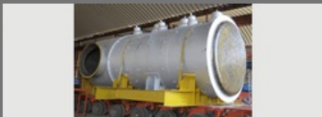
Waste Heat Boiler