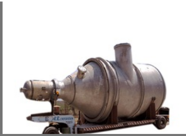
Industrial Vacuum Separator