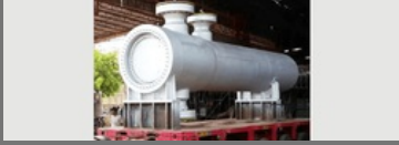
HHPS Vapour/Treat Gas Exchanger