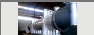
Separated Gas Cooler