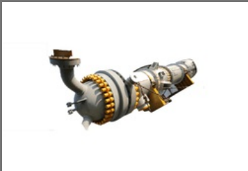
Ammonia Converter Effluent/Steam Generator