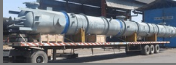
Trichlorosilane Heavy Impurity Column