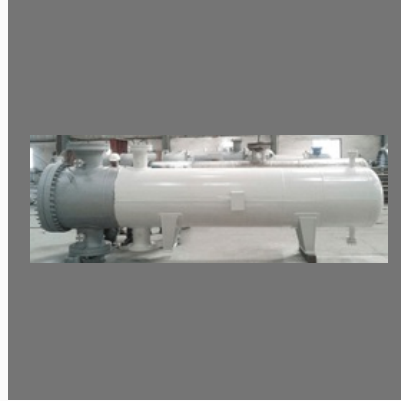
CO2 Compression First Stage Discharge Cooler