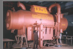
Standpipe And Flash Tank Condenser