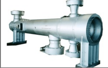
Second Stage Effluent Hot Recycle Gas Exchanger