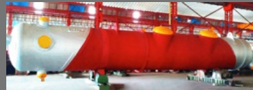
Low-Pressure Duplex Heater