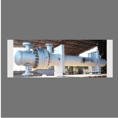
Regeneration Gas Cooler