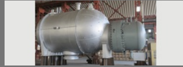
Ethylene Product Vaporiser