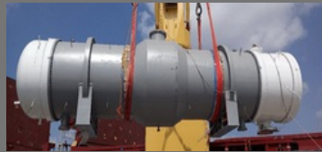
Purification Column Condenser