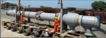
Carbonate Feed/Effluent Exchanger