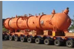
HP Feed Water Heater