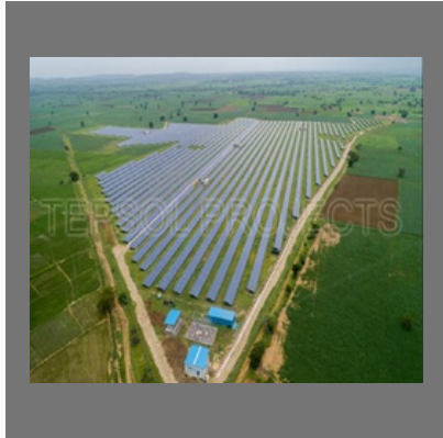
19.5 MW Solar PV Power Plant Project