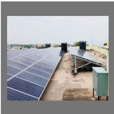
272 KWp Rooftop Solar PV System Under Construction Project