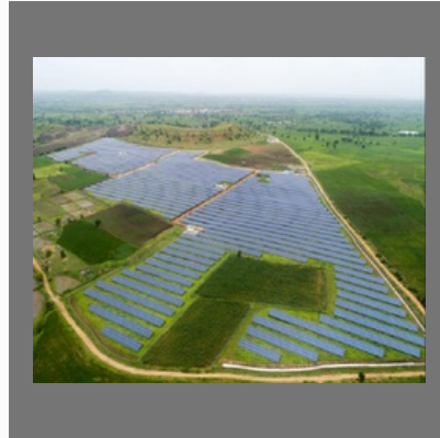
13 MW Solar PV Power Plant Project