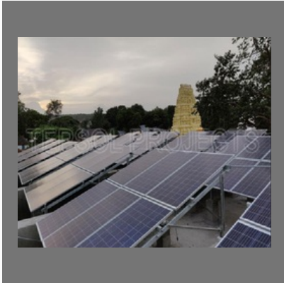
242 KWp Rooftop Solar PV System Under Construction Project