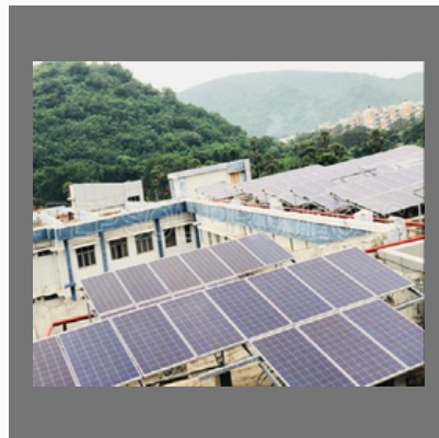
220 KWp Rooftop Solar PV System Under Construction Project