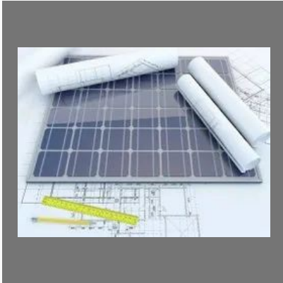
Solar Power Plant EPC Service