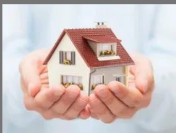
Home Loan Services