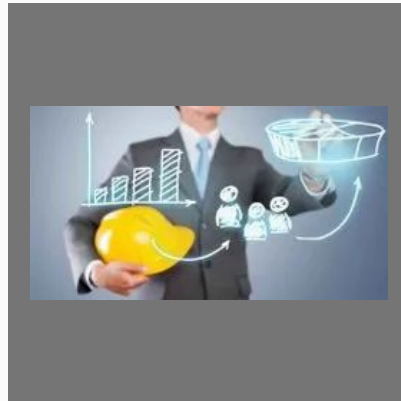
Project Finance Services