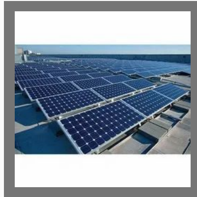
Solar EPC Contractor Service