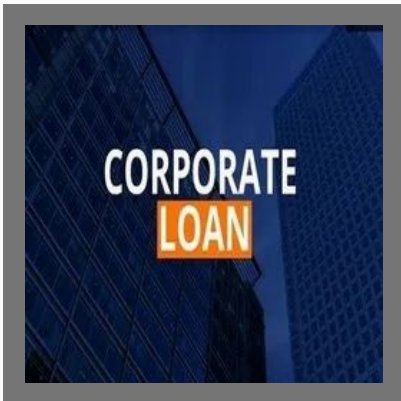
Corporate Loans Service