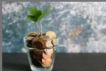
Loan Against Property Services