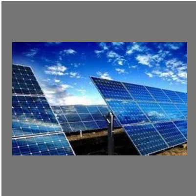
Solar Renewable Energy Service