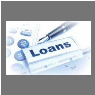
Unsecured Corporate Loan Services