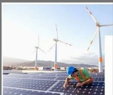
Solar Panel EPC Services