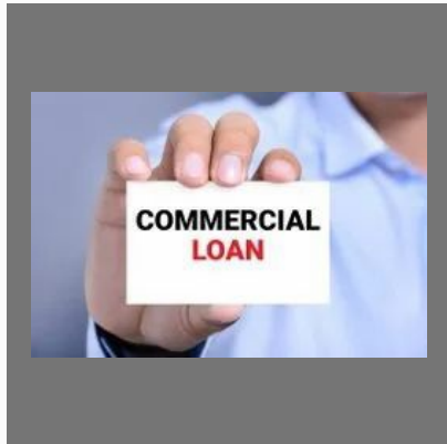
Commercial Loans Services