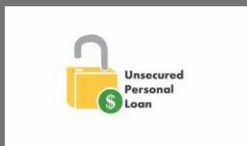
Unsecured Personal Loans Service