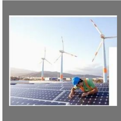
Solar EPC Service