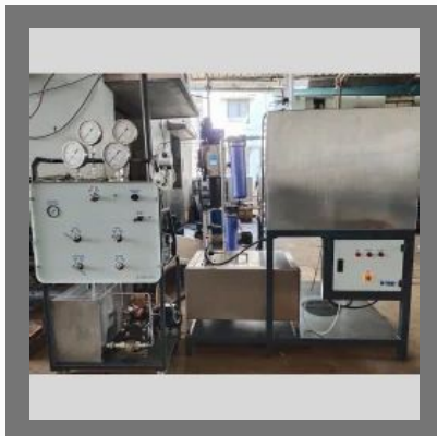
RECIRCULATION HYDRO PUMP FOR VALVE TESTING