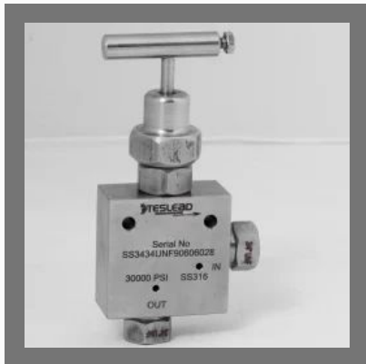
TWO WAY ANGLE NEEDLE VALVE