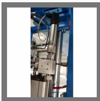
PRESSURE TRANSDUCER FITTINGS