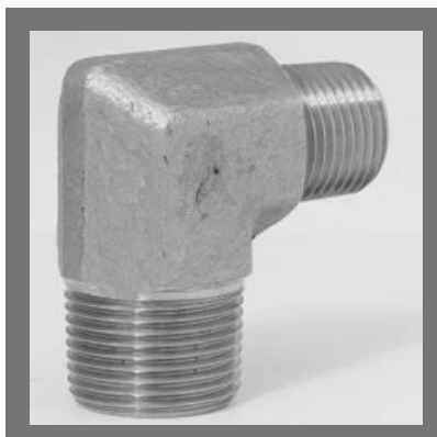
NPT ELBOW FITTING