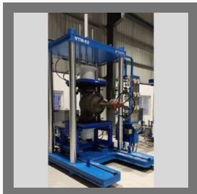
180 TON SINGLE STATION