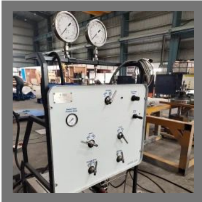
PORTABLE HYDROSTATIC TEST STAND