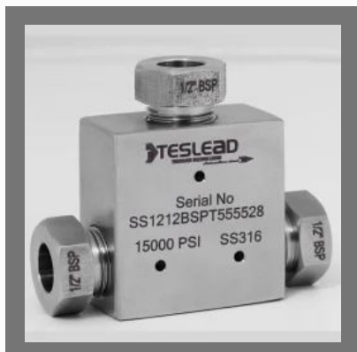
UNF CONICAL TEE