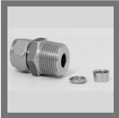
M FERRULE FITTING