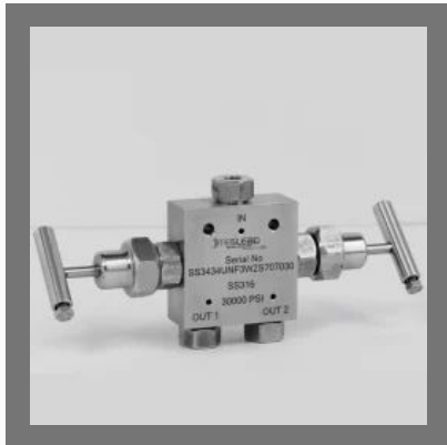
THREE WAY TWO STEM NEEDLE VALVE