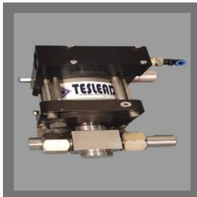
HYDROSTATIC BOOSTER PUMP