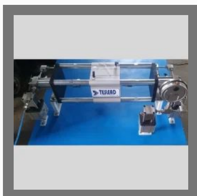
Gas Booster Pump