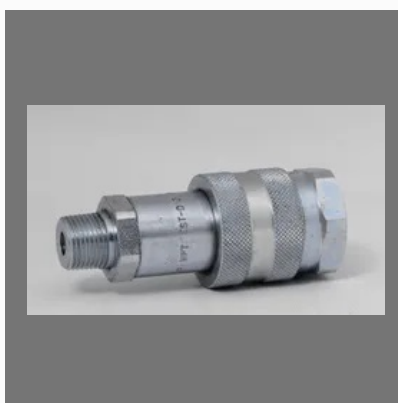
Hydraulic Quick Release Coupling