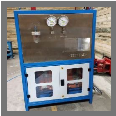
HIGH PRESSURE GAS TEST STAND