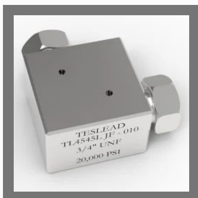
L JOINT FITTING