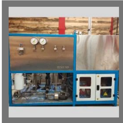
HIGH PRESSURE HYDRO & GAS TEST STAND