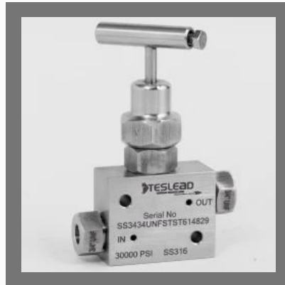
TWO WAY STRAIGHT NEEDLE VALVES