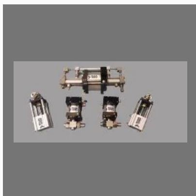
High Pressure Hydro Booster Pump