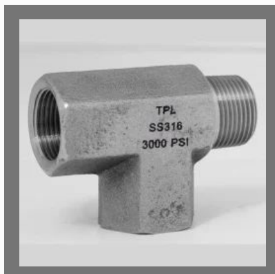
NPT TEE FITTING