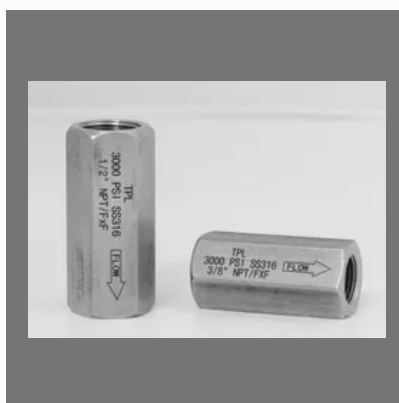
High Pressure Non Return Valves