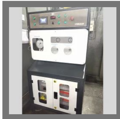
HIGH PRESSURE HYDRO TEST STAND