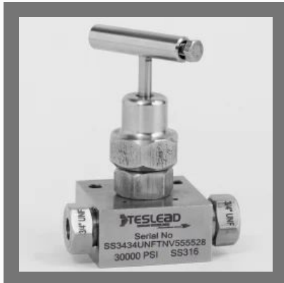
THREE WAY TEE CONNECTION NEEDLE VALVE