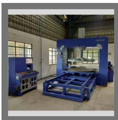
250 TON SINGLE STATION