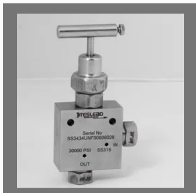
High Pressure Needle Valves