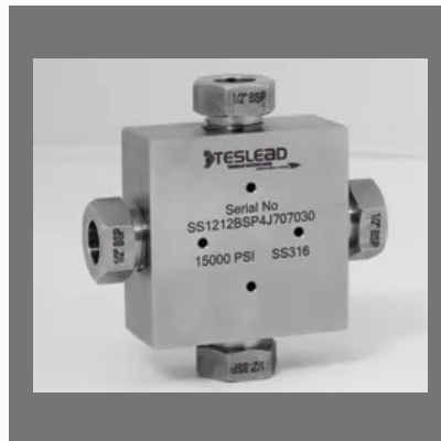
High Pressure Fittings