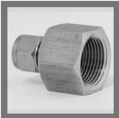
F FERRULE FITTING