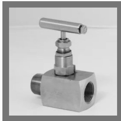
NPT NEEDLE VALVES