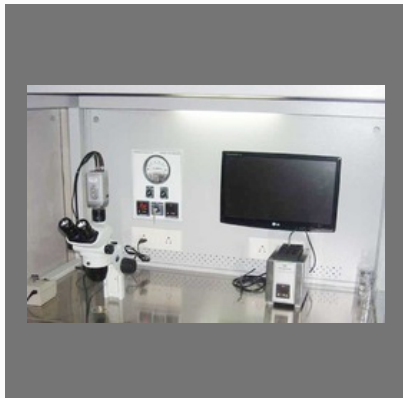
IUI with Donor Sperms (AID)