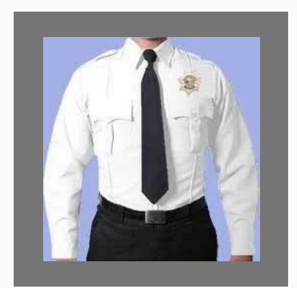
Uniforms For Security Guard