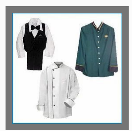
Hotel Staff Uniform