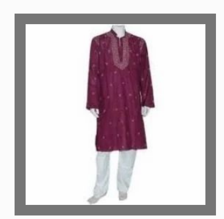
Pajama Kurta for Men