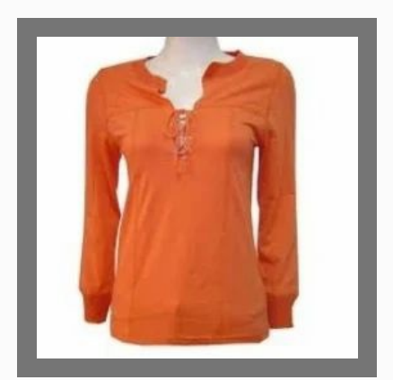
Ladies Fancy Top