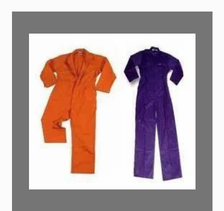
Industry Staff Uniform