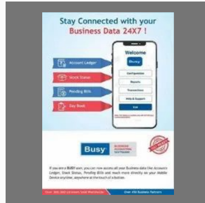
Mobile Business Management Software