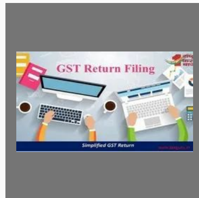
Gst Return Filing