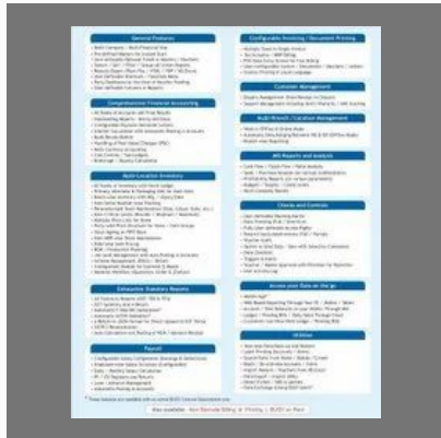
Busy Accounting Inventory Software