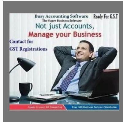
Busy Accounting Software