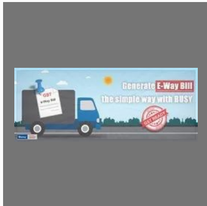
E Way Bill Accounting Software