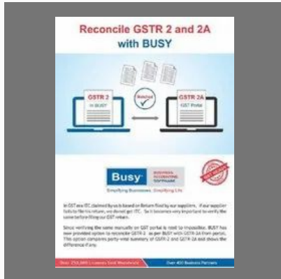
GSTR 2A GST Reconciliation Software