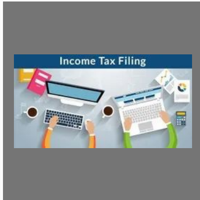
Income Tax Return