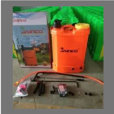
Sanitizer Spray Machine