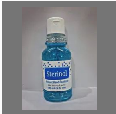
Sterinol - 150 mL Hand Sanitizer