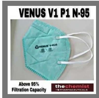
Venus N95 Mask