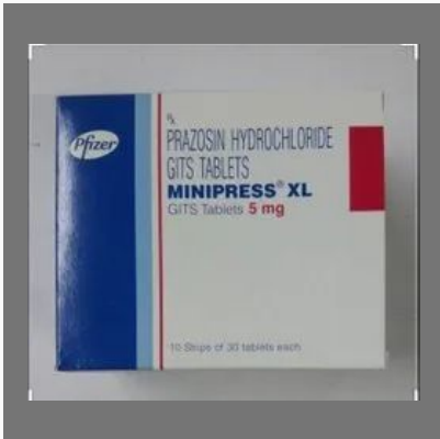
Minipress XL 5mg