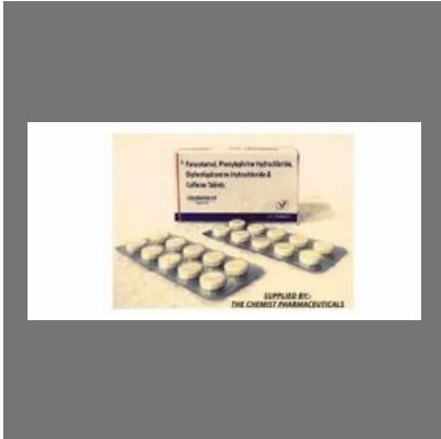
Coldvoiz-CF For Cold And Flu