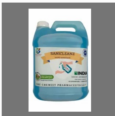
SANICLEANZ HAND SANITIZER