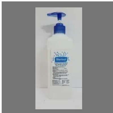
Sterinol - 500 mL Hand Sanitizer