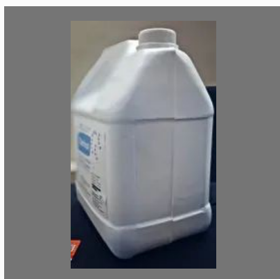
Sterinol - 5L Hand Sanitizer