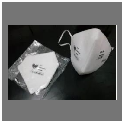
N95 Face Mask