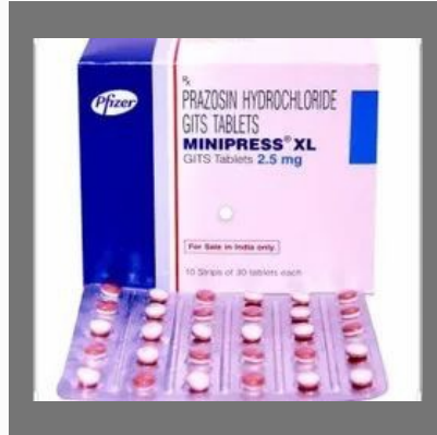
Minipress XL 2.5mg