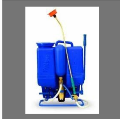
Sanitizer Spray Machine