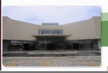
Buildings Post Tensioning Slab