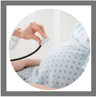
High Risk Pregnancy Services