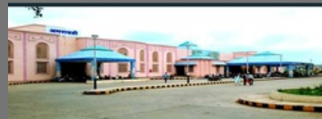
Environmental Engineering Course