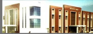
Marine Engineering course