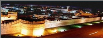
Mechanical Engineering Course