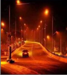
Electrical Engineering course