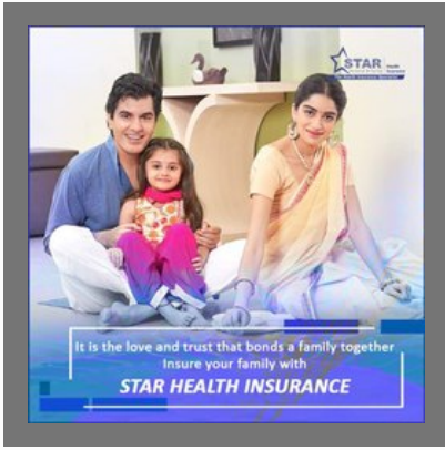
Health Insurance Service