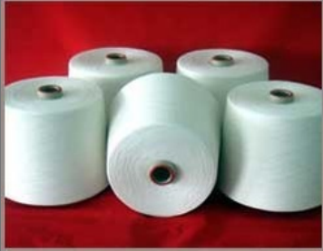
Carding & Spinning Cotton Yarn