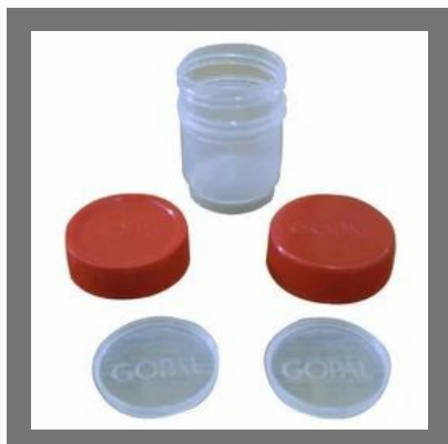
Csd Jar Caps