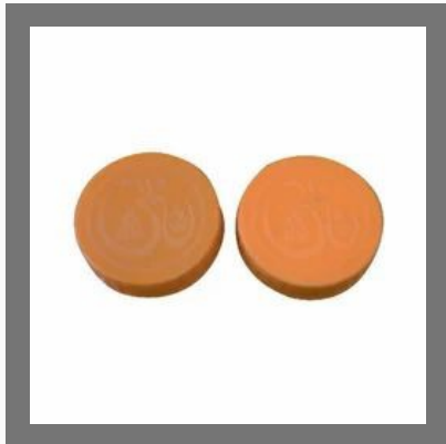
Plastic Container Caps