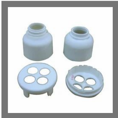
Plastic CFL Holders