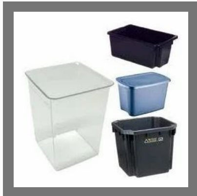
Plastic Containers .