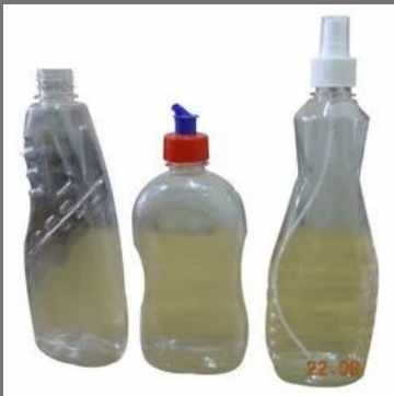
PET Floor Cleaner Bottles