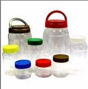
Plastic Pet Jars .