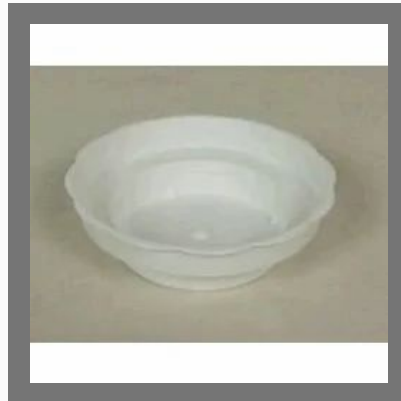
Plastic Moulded Bowl