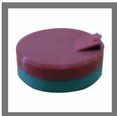
Plastic Moulded Components