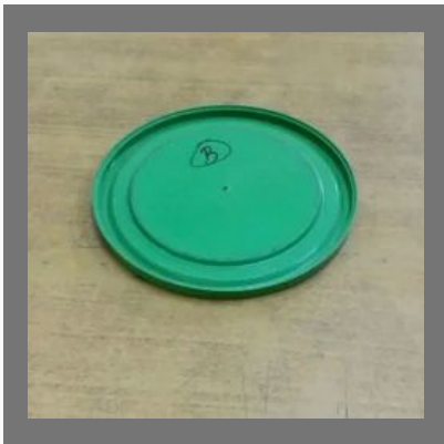
Plastic Air Tight Caps