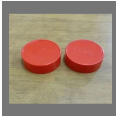
Pet Container Cap