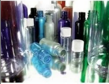
PET Bottles .