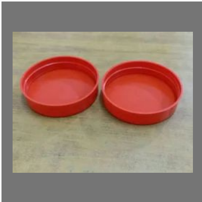
Pet Container Cap