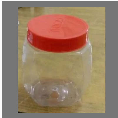
Plastic Pet Jar .