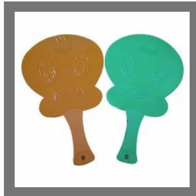
Plastic Moulded Fans