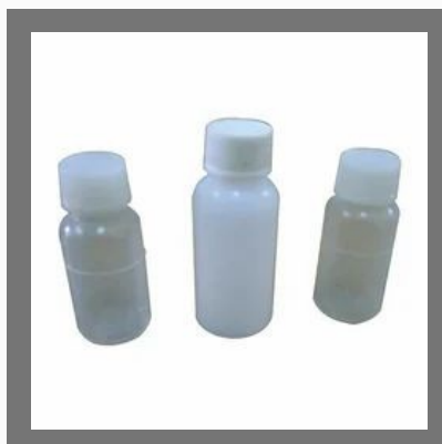
Dry Syrup Bottles