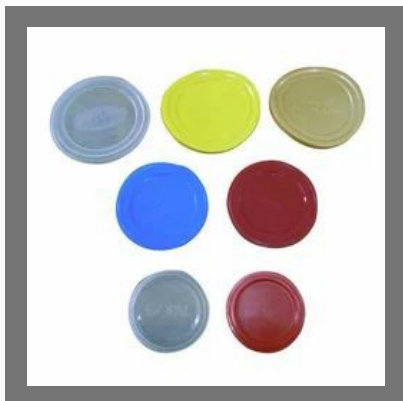
Plastic Caps .