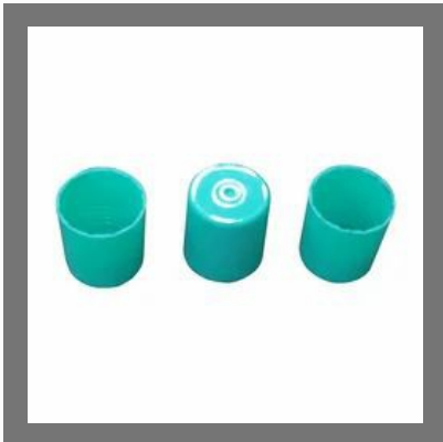
Plastic Jar Caps