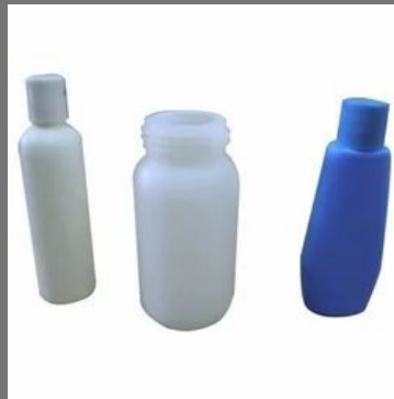
Blow Molded Bottles .