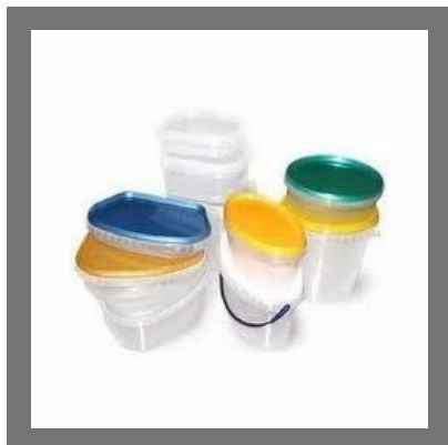
Plastic Moulded Containers