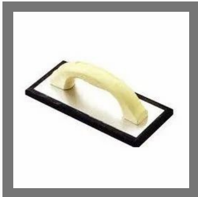
Plastic Moulded Handles