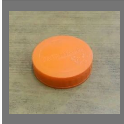
Honey Plastic Cap