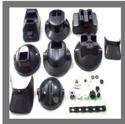
Plastic Moulded Components