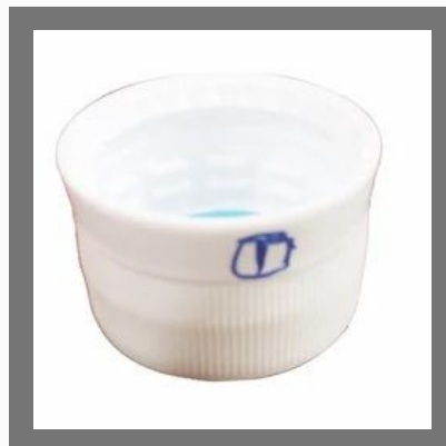
CSD Container Caps