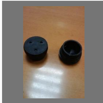
Rotor Plastic Caps