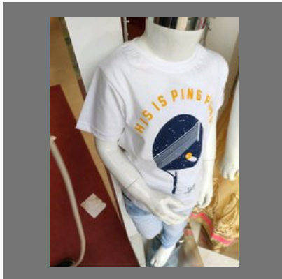
Boys T-Shirt Pant