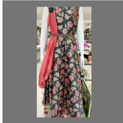
Girls Fancy Dress