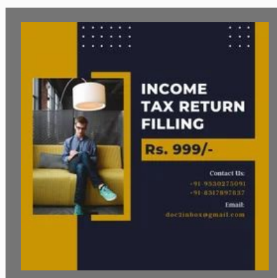
Income Tax Return Filing Services