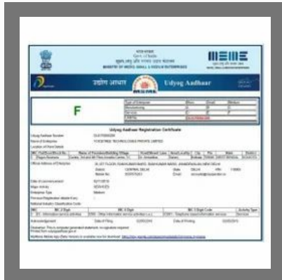
MSME Registration Consultancy Service