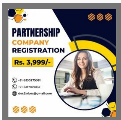
Partnership Firm Registration Service