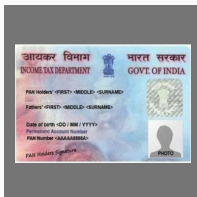
Online PAN Card Applying Services