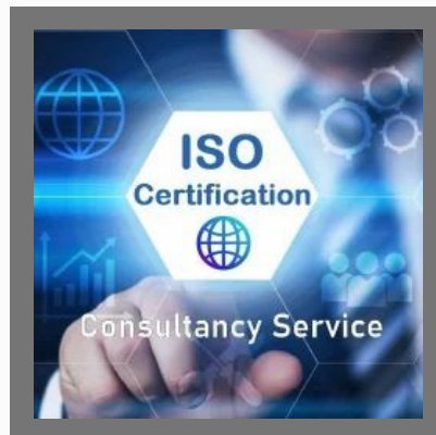
ISO Certification Consultancy Service