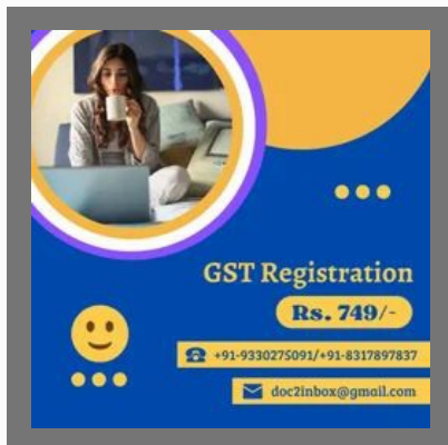
GST Registration Consultancy Service