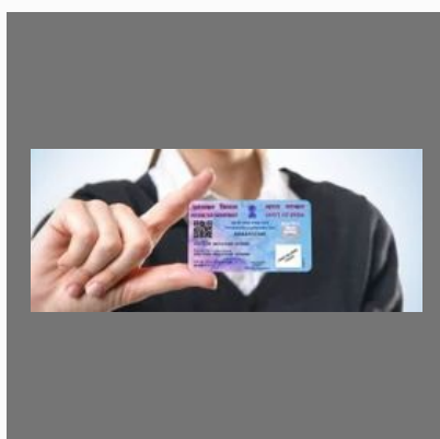
PAN Card Correction Service