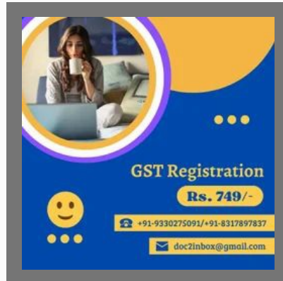
GST Consultancy Service