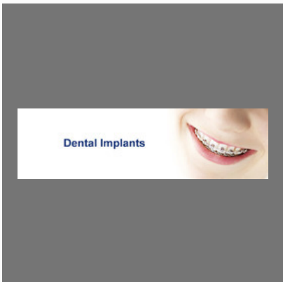
Crown And Bridges