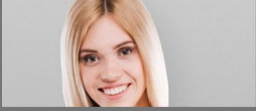
Breast Cosmesis Surgery