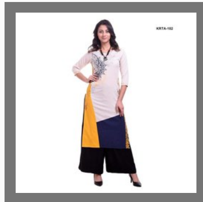
Lakshish Multicolor Straight Printed Cotton Kurta