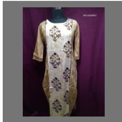
Rayon Kurta Print With Embroidery