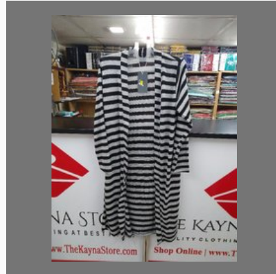
Long Woolen Shrug Dress For Woman