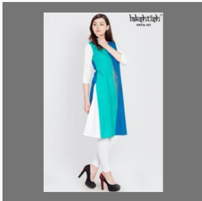
Lakshish Multicolor A Line Printed Cotton Kurta