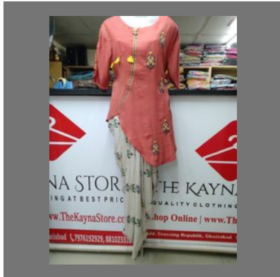
Patiala Palazzo Suit With Designer Rayon Kurti