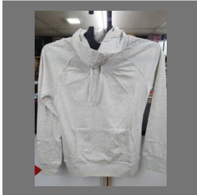
White high neck top for woman