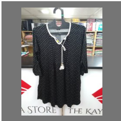
Black Lycra Long Top For Winter