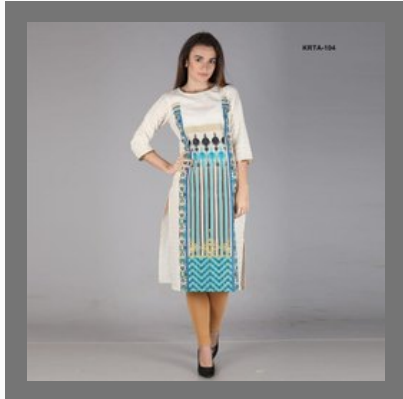
Lakshish Multicolor Straight Printed Cotton Kurta