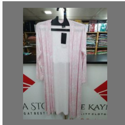
Long Pink Printed Shrug Dress