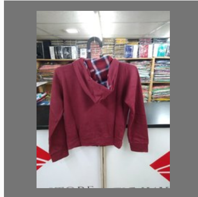
Maroon Woolen Hood Jacket