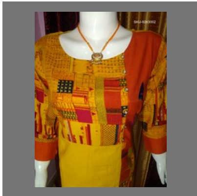
Yellow Straight rayon kurti