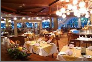
Veg Restaurant Services