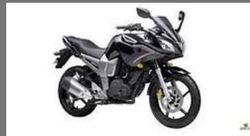
Two Wheeler Renting