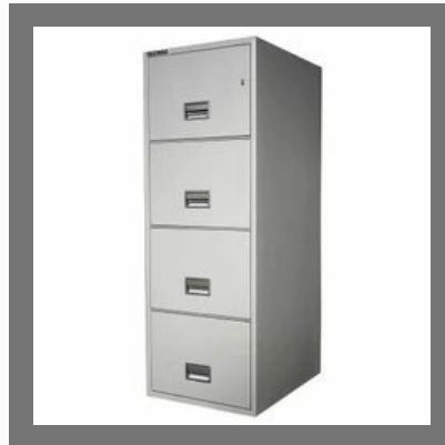
Office File Cabinet