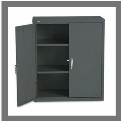
Mild Steel Storage Cabinet