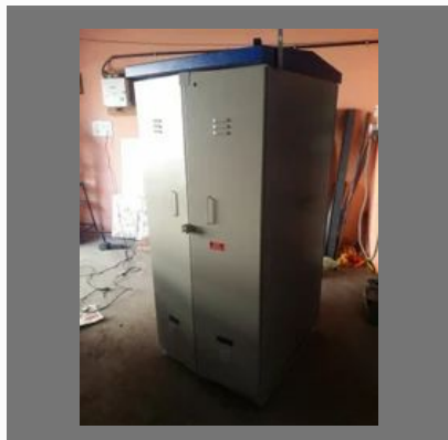
11 Kv L B S Panel