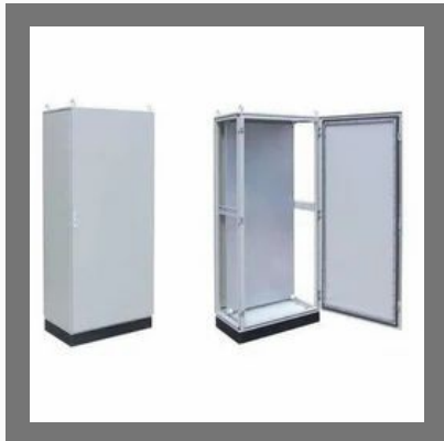
Sheet Metal Cabinet