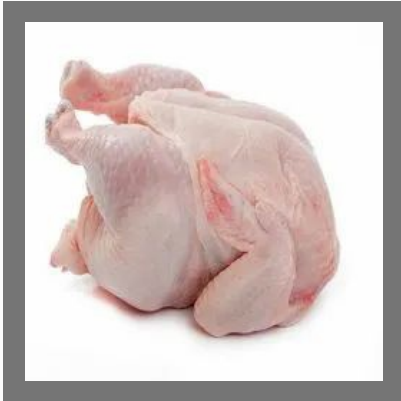
Premium Halal Whole Chicken