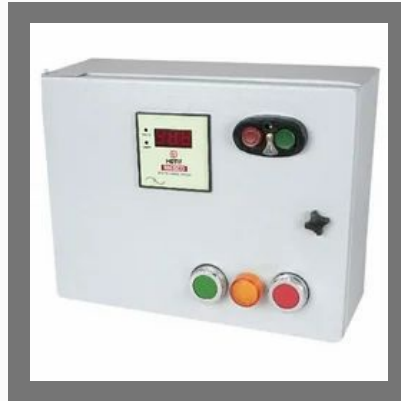
Submersible Control Panel