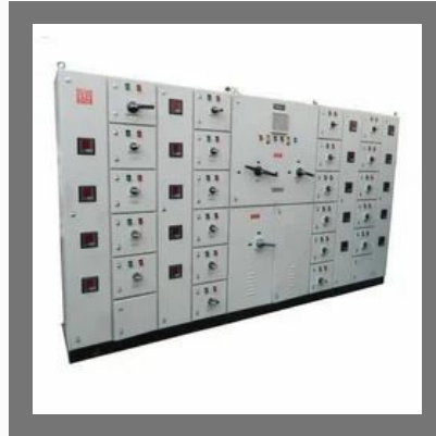
Power Distribution Control Panel