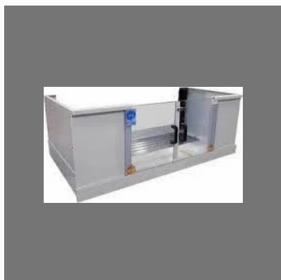
CNC Machine Guard