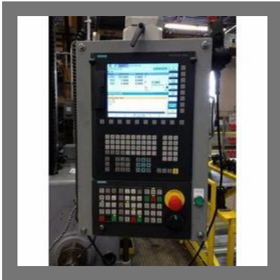
CNC Control Panel