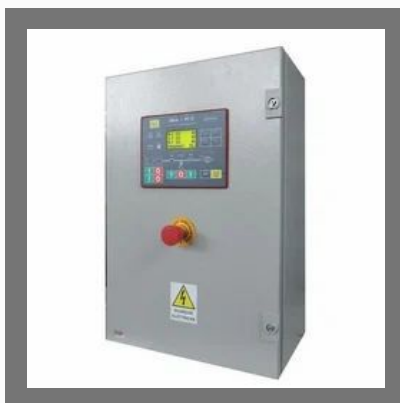
Control Panel Board