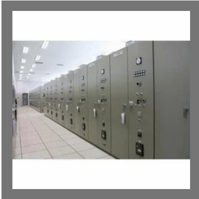
Electric Control Panel