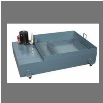
CNC Machine Coolent Tank