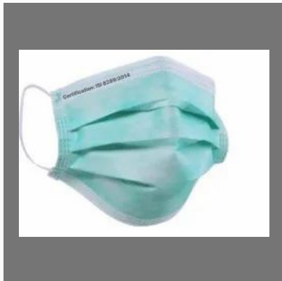
Venus V1010 3 Ply Mask