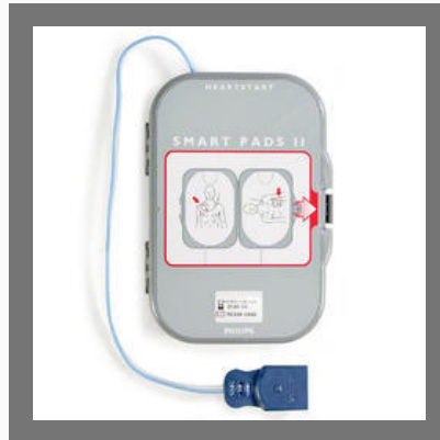
Philips Heartstart Frx Smart Pads II Electrode Pad