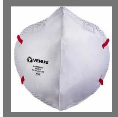
Venus V 4400 N95 Mask