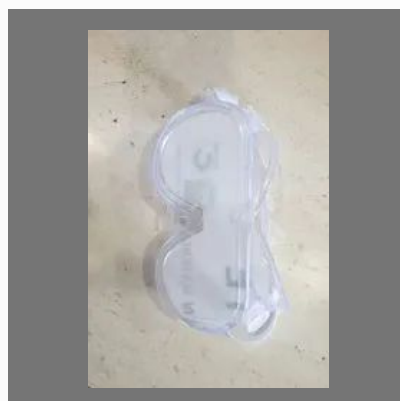
Safety Goggles For Eye Protection