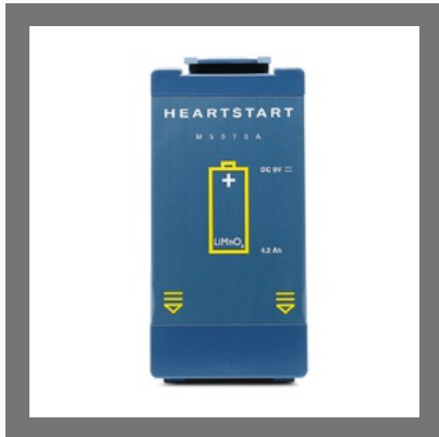
Philips Heartstart Hs1 Frx Battery Pack