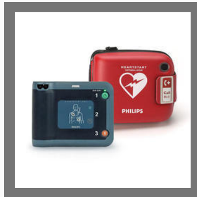
Philips Heartstart FRx AED