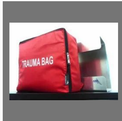
ARIS TRAUMA KIT