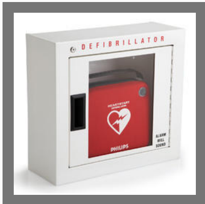
Philips Defibrillator Cabinet