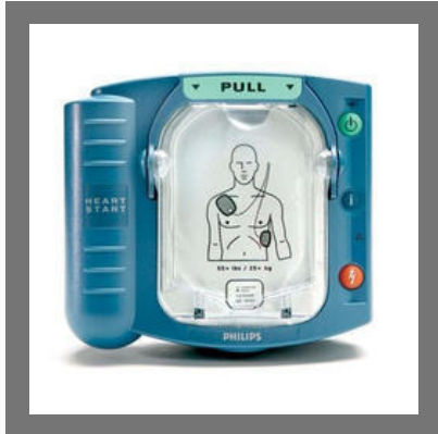
Philips Heartstart Hs1 First Aid Defibrillator