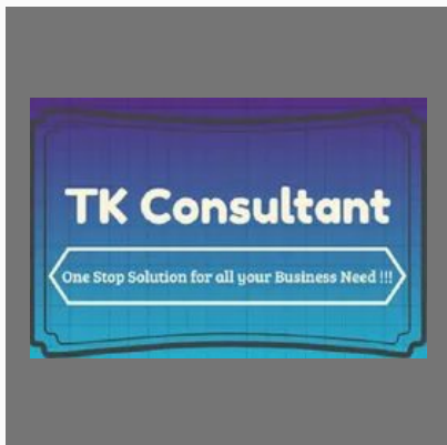
Web Application Security Audit