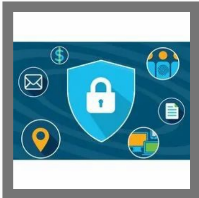
Information Security Service