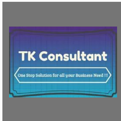
Mobile Application Security Audit