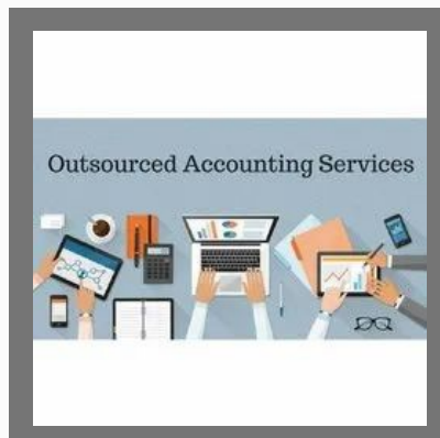
Zoho Books Accounting Services