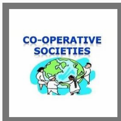
Accounting For Co-Op Societies Services