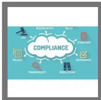
RoC Compliance Filing Services