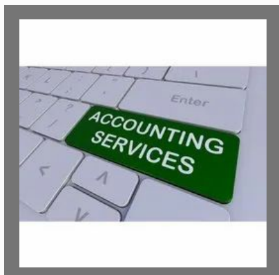
Book Keeping Accounting Services