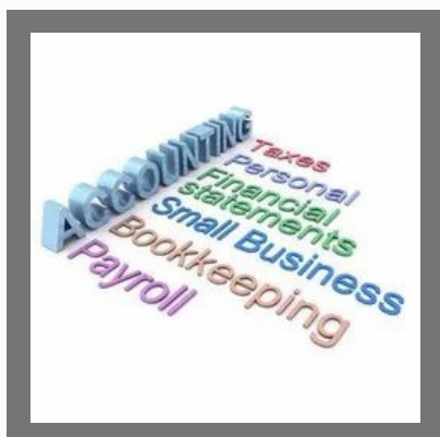
Quickbooks and Hostbook Accounting Services