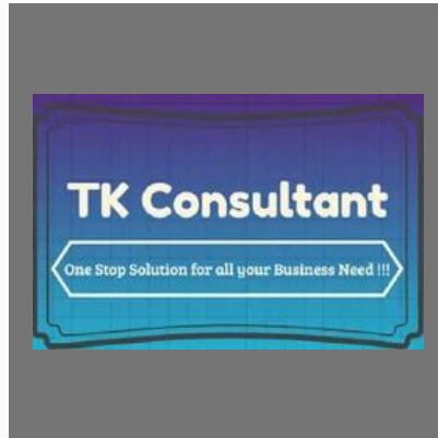
Application System Audit