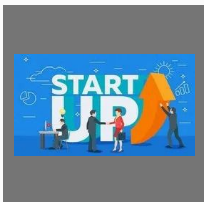
Business Startup Services