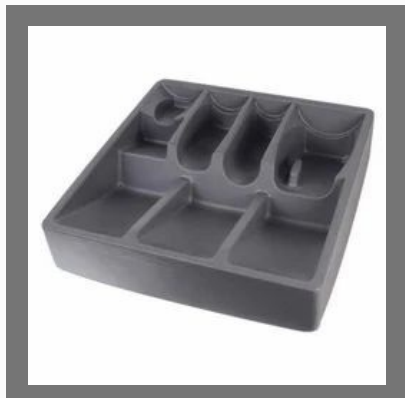
Vacuum Formed Trays