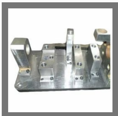
Jig Fixture Component