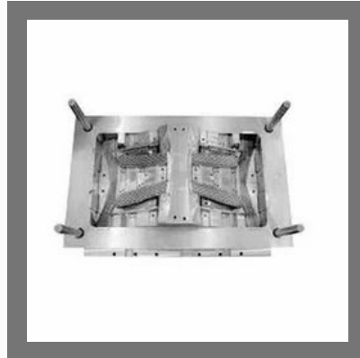
Plastic Moulding Dies