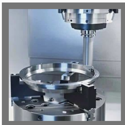
VMC Machine Job Work Services