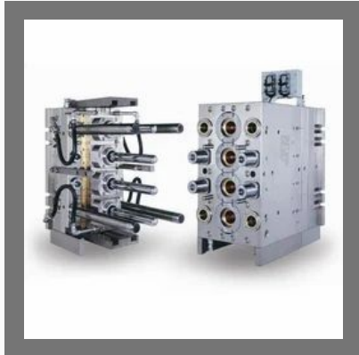
Plastic Moulding Dies