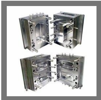
Injection Moulding Dies