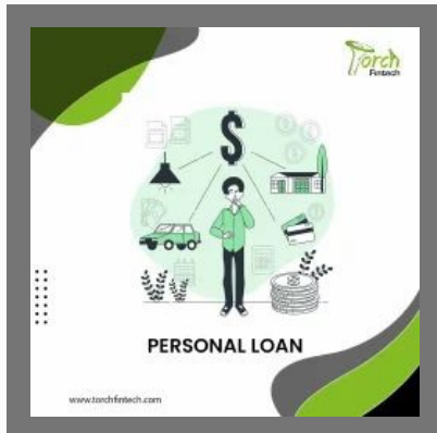
Personal Loan Service