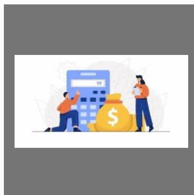
Investment Advisory Service