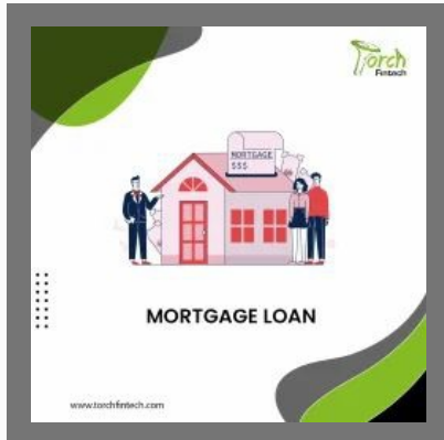
Mortgage Loan Service