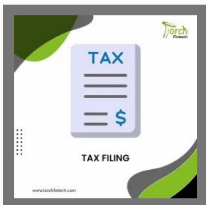
Income Tax Filing Service