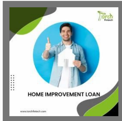
Home Improvement Loan Service