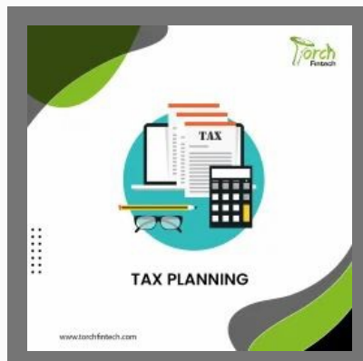
Tax Planning Service