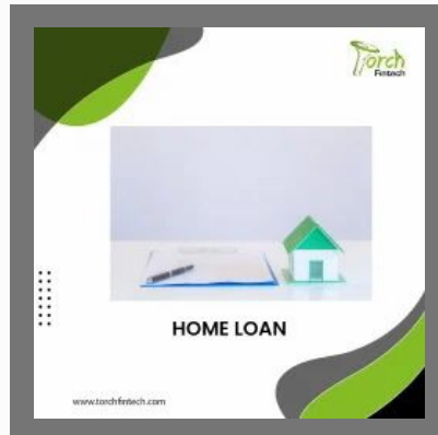
Home Loans Provider Service