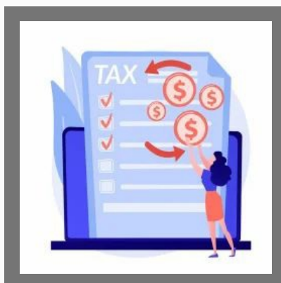
Tax Consultancy Service