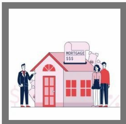
Financial Credit Advisory Service