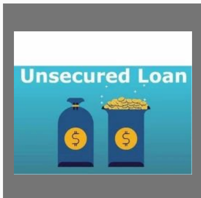
Unsecured Personal Loan Service