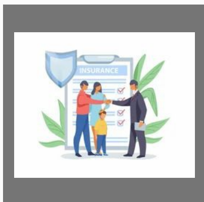
Insurance Planning Service