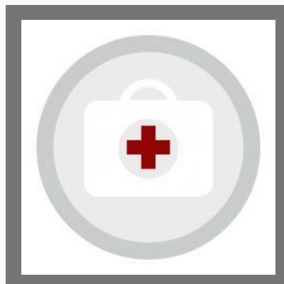
Alternative Care Service