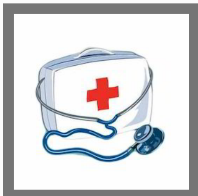
Medical Insurance Service