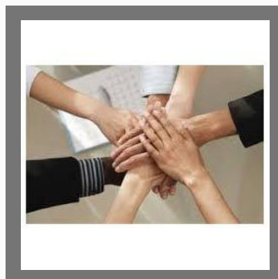
Manpower Recruitment Service For Hospital