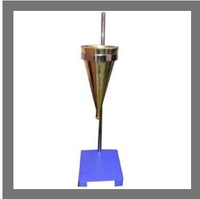
Marsh Cone Testing Equipment