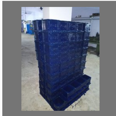
Cube Mould 150 Mm