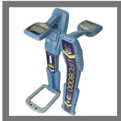
Radiodetection Cable Pipe Locator. Authorized India Distributor