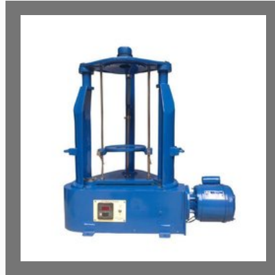
Rotap Sieve Shaker Digital