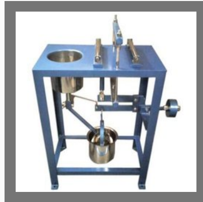
Tile Flexure Strength Testing Machine