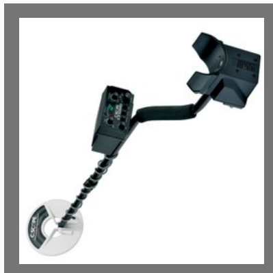
CS1220XD Metal Detector