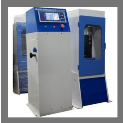
3000 Kn Compression Testing Machine