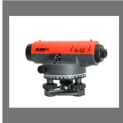
Averex Auto Level