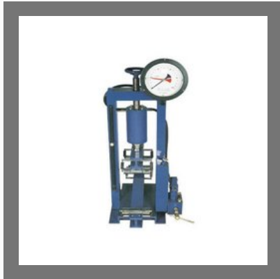
Flexural Testing Machine