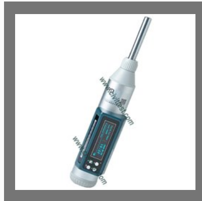
Digital Rebound Test Hammer