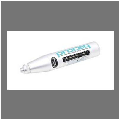
Schmidt Concrete Testing Hammer PROCEQ