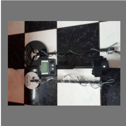
CSR1 Metal Detector