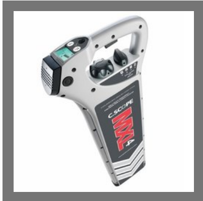
MXL4 Pipe & Cable Locator