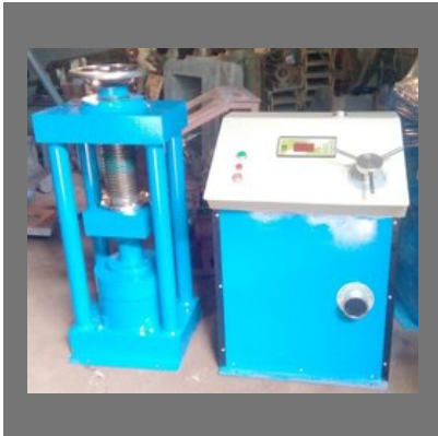
2000 k.N Digital Compression Testing Machine