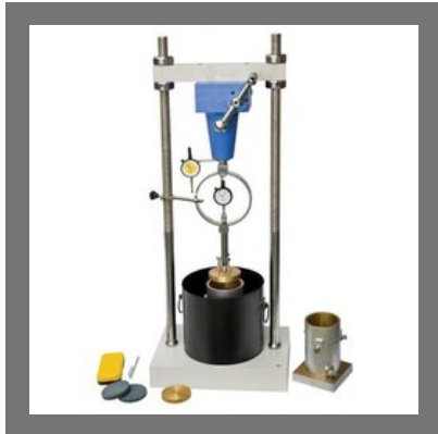
Swelling Pressure Test Apparatus