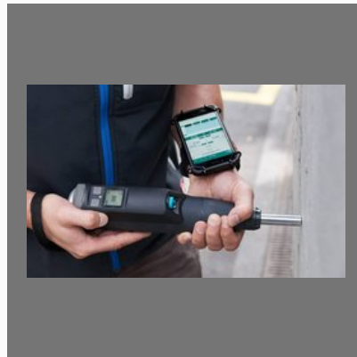
Proceq Original Schmidt OS8000