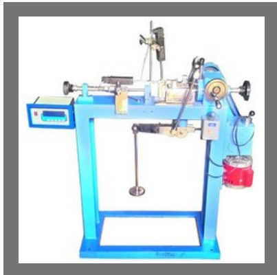
Direct Shear Test Digital