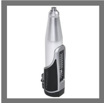
Mechanical Concrete Test Hammer