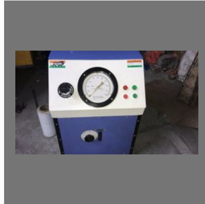
Compression Testing Machine 2000 K.n Electric Model