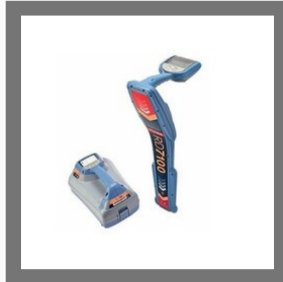
SPX-RD7100 Cable Locator