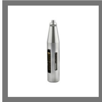
Concrete Rebound Hammer NOVOTEST SH