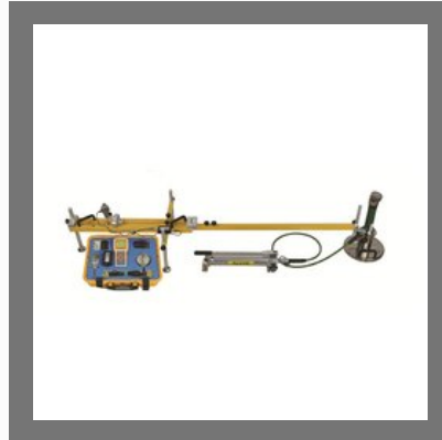
Static Plate Load Test Ev2