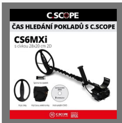
CS6MXi Metal Detector