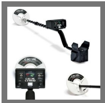
CS990XD Metal Detector