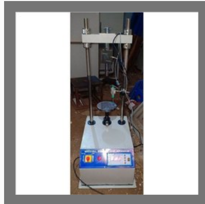
Digital Marshall Stability Testing Machine