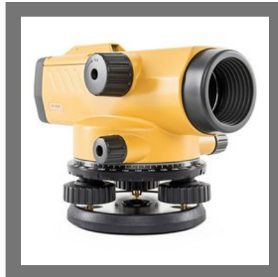
Averex Auto Level