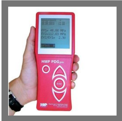
HMP PDG pro Digital Static Plate Load Tester