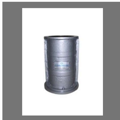
Cylindrical Mould 150 X 300mm