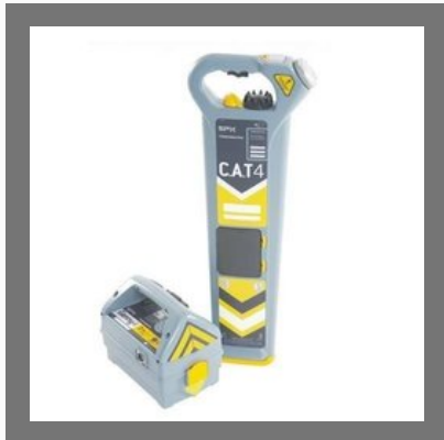
Cables and Pipeline Locator cat4