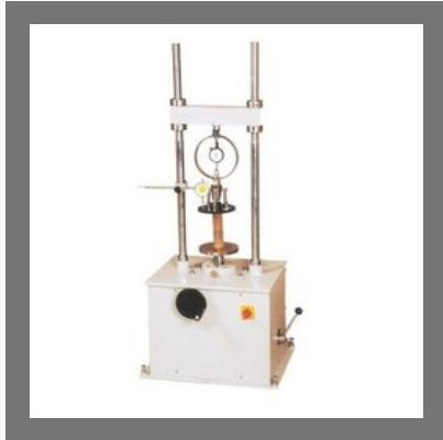
Unconfined Compression Test