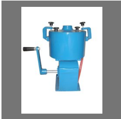
Hand Operated Bitumen Extractor