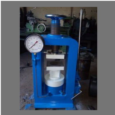
Compression Testing Machines 1500 k.n. (150 ton)