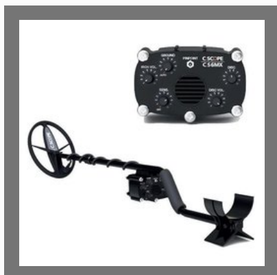
CS4MX1 Metal Detector