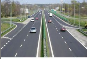
National Highway Division Project