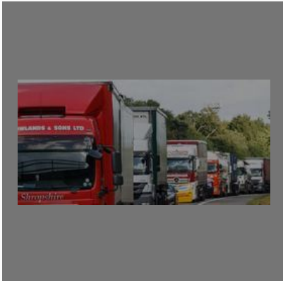
Traffic Engineering Service