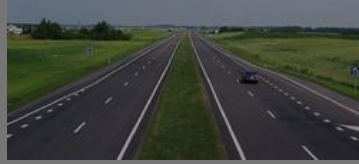
Kalthia Engineering And Construction Project