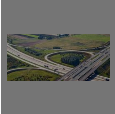
Highway And Bridge Engineering Service