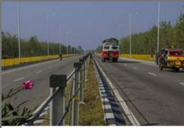
Moradabad Bareilly Expressway Project