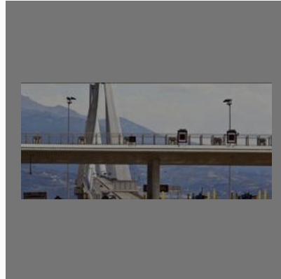
Toll Road Services And Financial Advisory Service