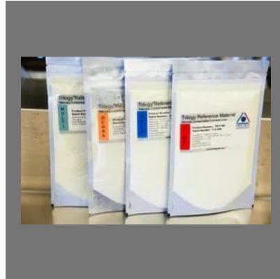
Certified Reference Materials