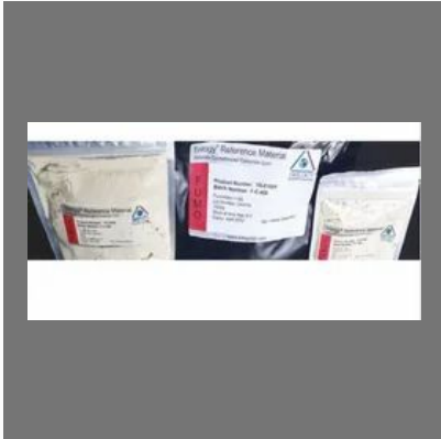
Custom Quality Control Materials