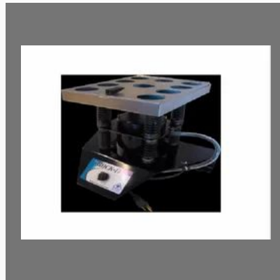
Rock It 360