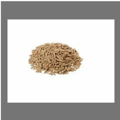
Mycotoxin Binder Analysis