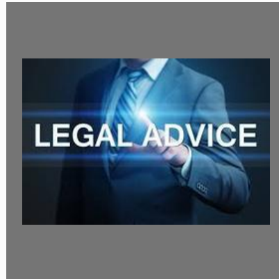
Legal Consultation Services