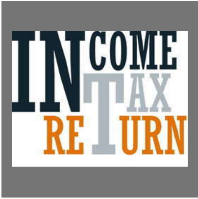
Income Tax Return