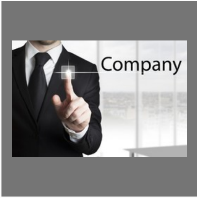
Company Registration Services