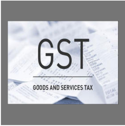
GST Registration Services