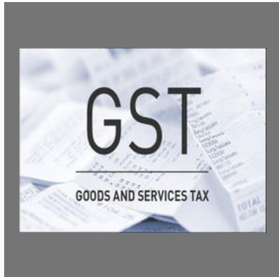
GST Return Filing Services