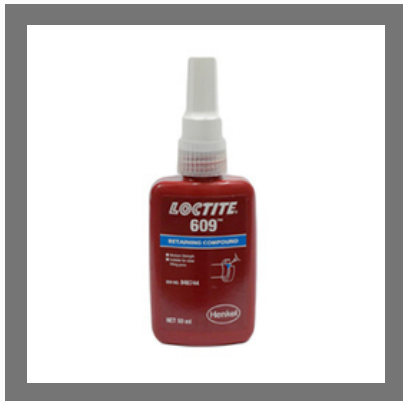
LOCTITE 609 Retaining Compound