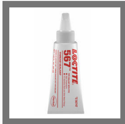
LOCTITE 567 Thread Sealants