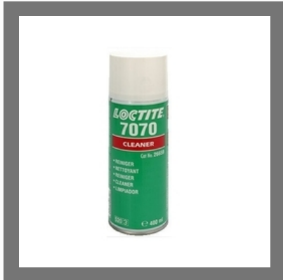
Loctite SF 7070 Adhesive Cleaner