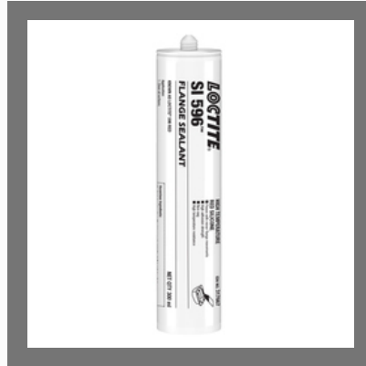
Loctite SI 596 Gasketing Compound