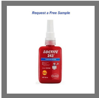
Loctite 243 Threadlockers