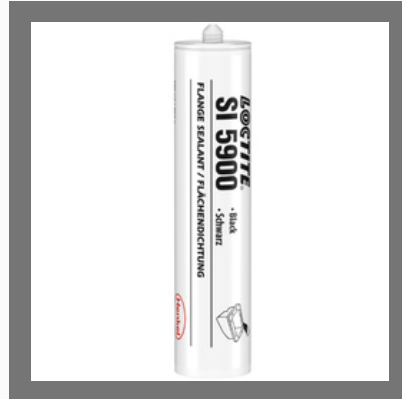
Loctite SI 5900 Gasketing Compound