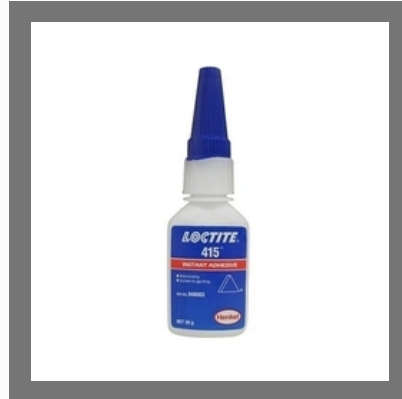
Loctite 415 Cyanoacrylate Instant Adhesive