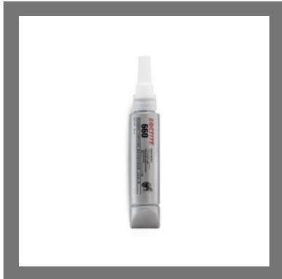
Loctite 660 Retaining Compound