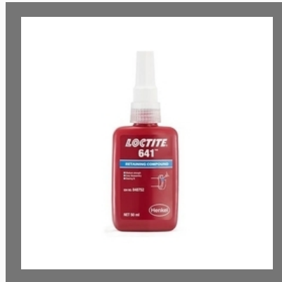
LOCTITE 641 Retaining Compound