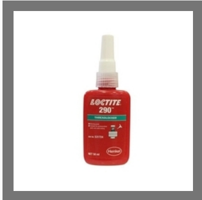
Loctite 290 Threadlockers