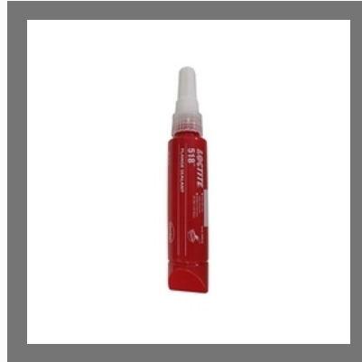
Loctite 518 Gasket Compound