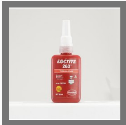
Loctite 263 Threadlockers