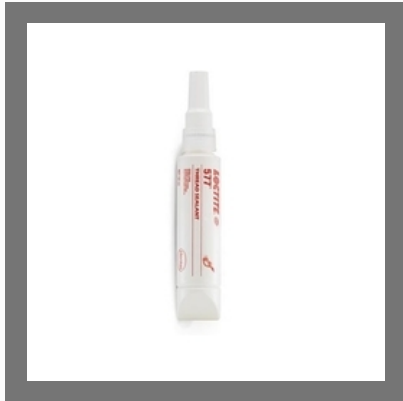
LOCTITE 577 Thread Sealants