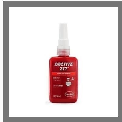
Loctite 277 Threadlockers