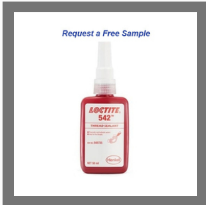
LOCTITE 542 Thread Sealants