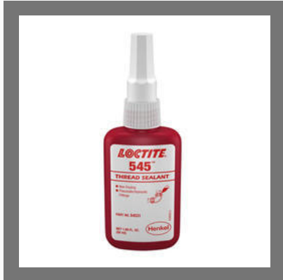
LOCTITE 545 Thread Sealants