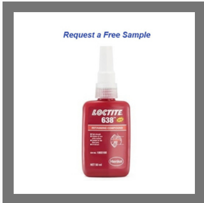
LOCTITE 638 Retaining Compound