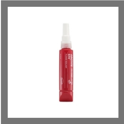
Loctite 574 Gasket Compound