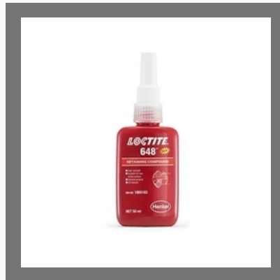
Loctite 648 Retaining Compound