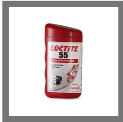
Loctite 55 Pipe Sealing Cord