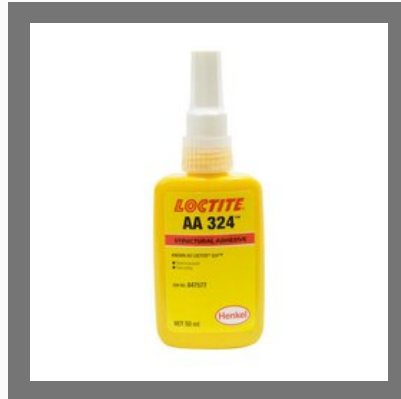
Loctite 324 Adhesives