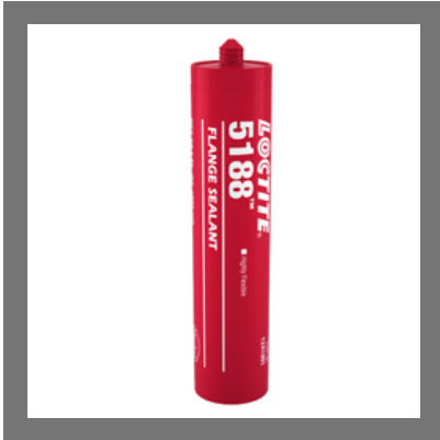
Loctite 5188 Gasketing Compound