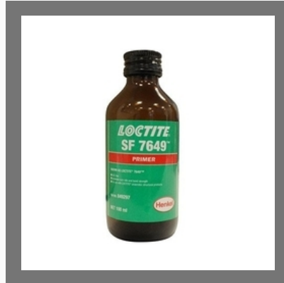
Loctite SF 7649 Primers