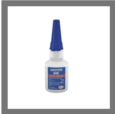
Loctite 406 Cyanoacrylate Instant Adhesive