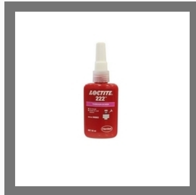
Loctite 222 Threadlockers