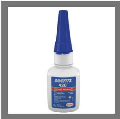
Loctite 420 Cyanoacrylate Instant Adhesive