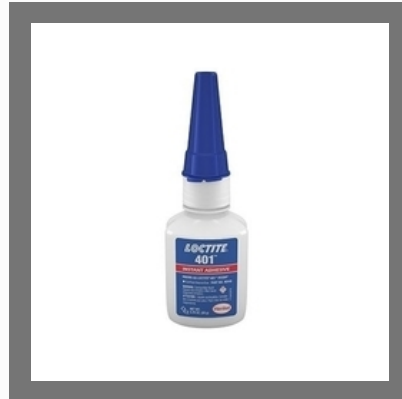
Loctite 401 Cyanoacrylate Instant Adhesive