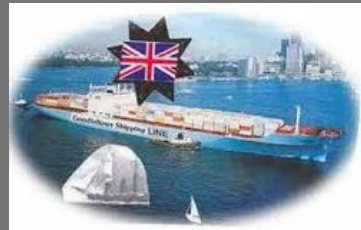
Advise on Imports/Exports