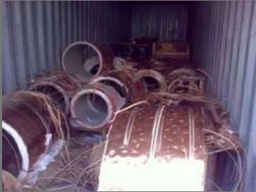
Chartered Engineers Certificate