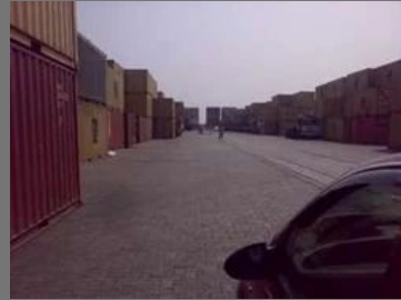
Chartered Valuation Certificate