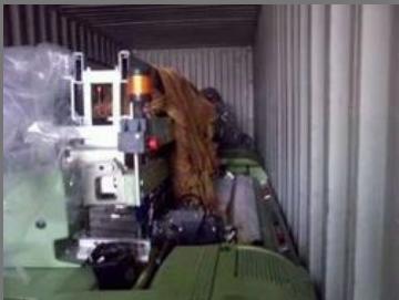
Chartered Pre-Shipment Certificate