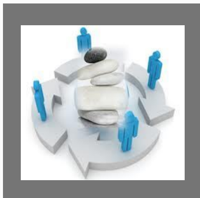
Financial Management Services