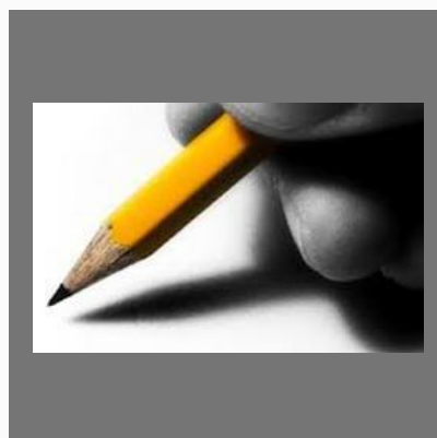
Writing Business Plans