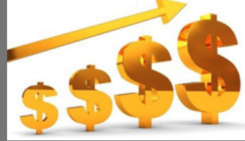
Equity And Debt Finance Services