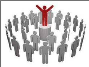
Strategic Consultancy Services