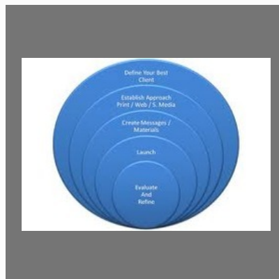
Marketing And Development Strategy