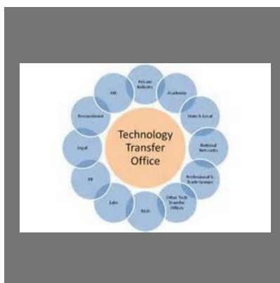
Technical Transfer Services