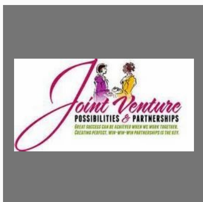
Joint Venture Services