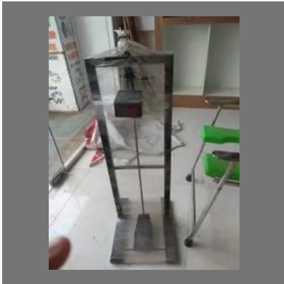
Foot Operated Sanitizer Dispenser