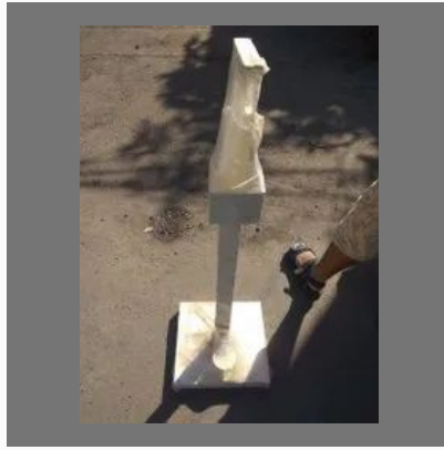
Foot Operated SANITIZER Dispenser