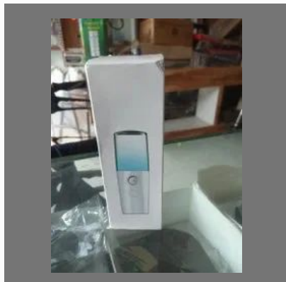
Mini Hand Sanitizer