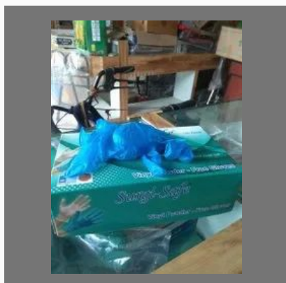
Surgi Safe Hand Gloves