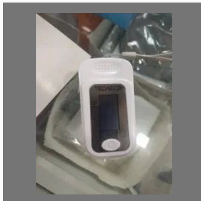
Hand Sanitizer Dispenser