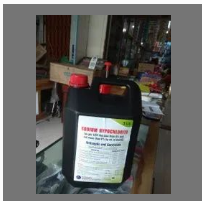
Sodium Hypochlorite Solution