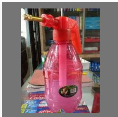
Hand Sanitizer Dispenser