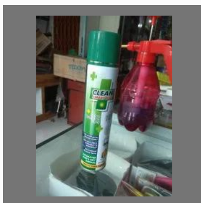
Surface Disinfectant Spray