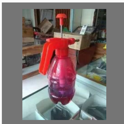
Hand Sanitizer Dispenser