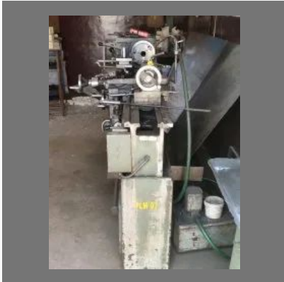
Precision Machined Components