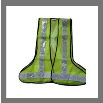
Reflective Safety Vests