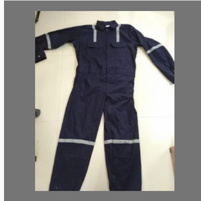
Reflective Cotton Boiler Suit