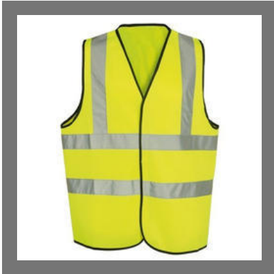
Sleeveless Safety Vests