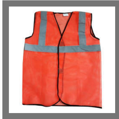
High Visibility Safety Vests