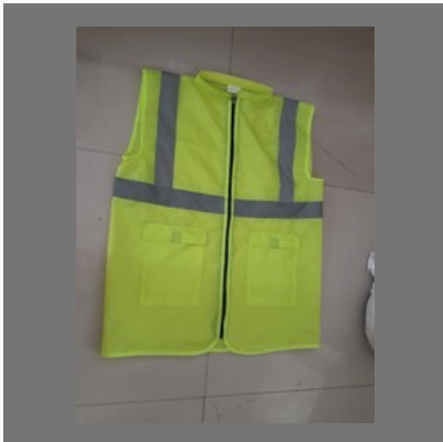
Waterproof Reflective Jacket