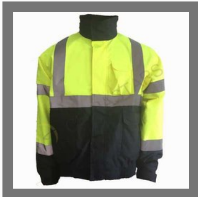
Polyester Reflective Winter Jacket