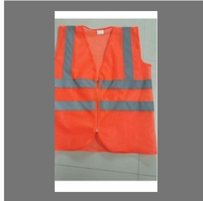
Reflective Safety Jacket