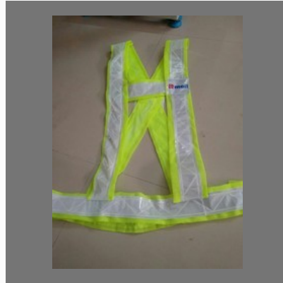
Safety Cross Belts