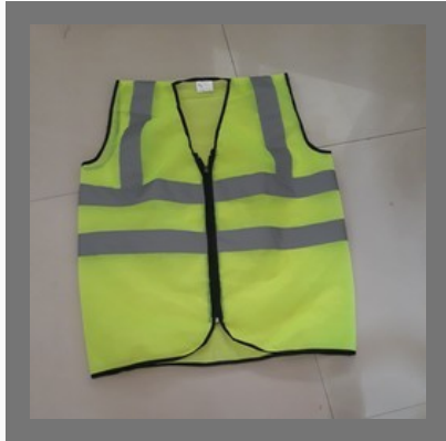
Construction Reflective Jacket