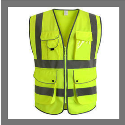
High Visibility Reflective Safety Vests