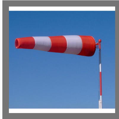
Safety Indicator Windsock