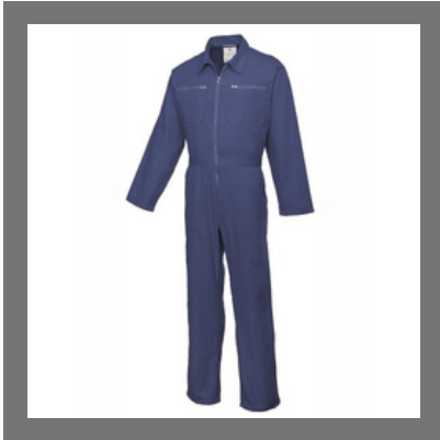
Cotton Boiler Suits